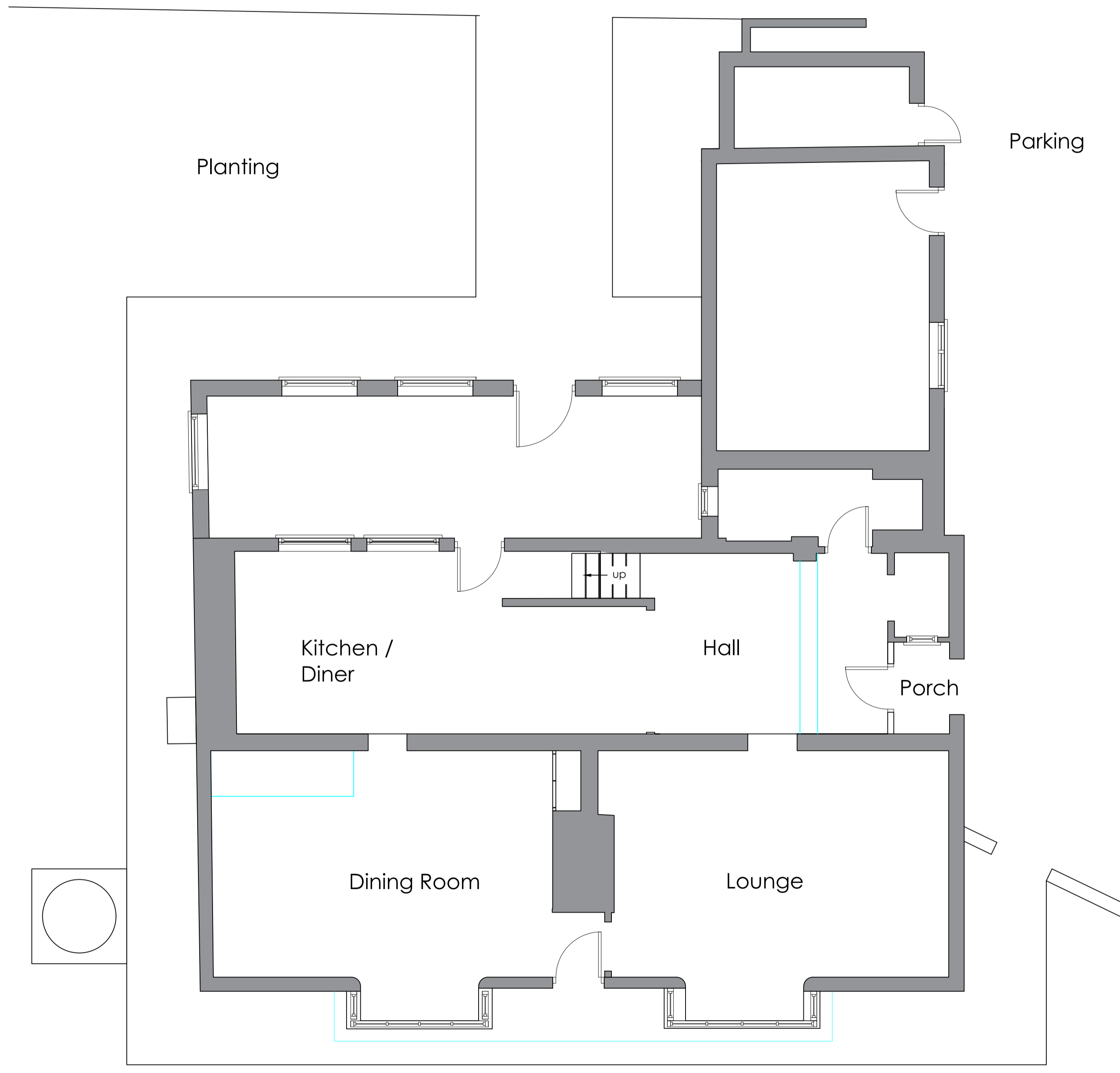
EXISTING GROUND FLOOR PLAN 1:50