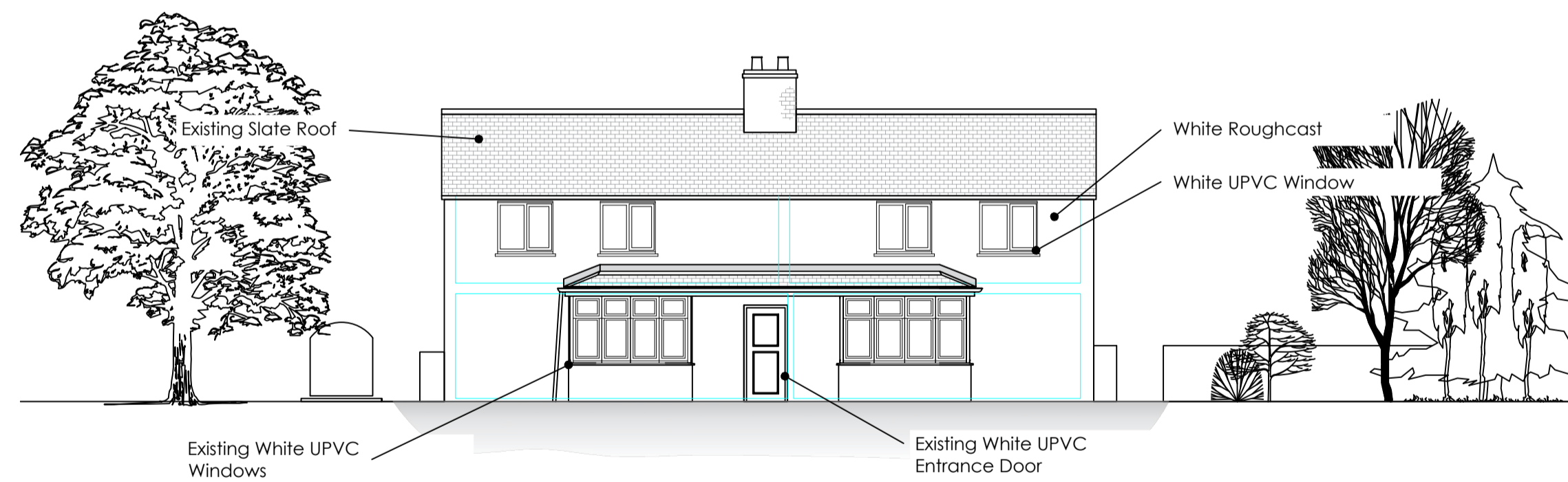
EXISTING SOUTH ELEVATION 1:100