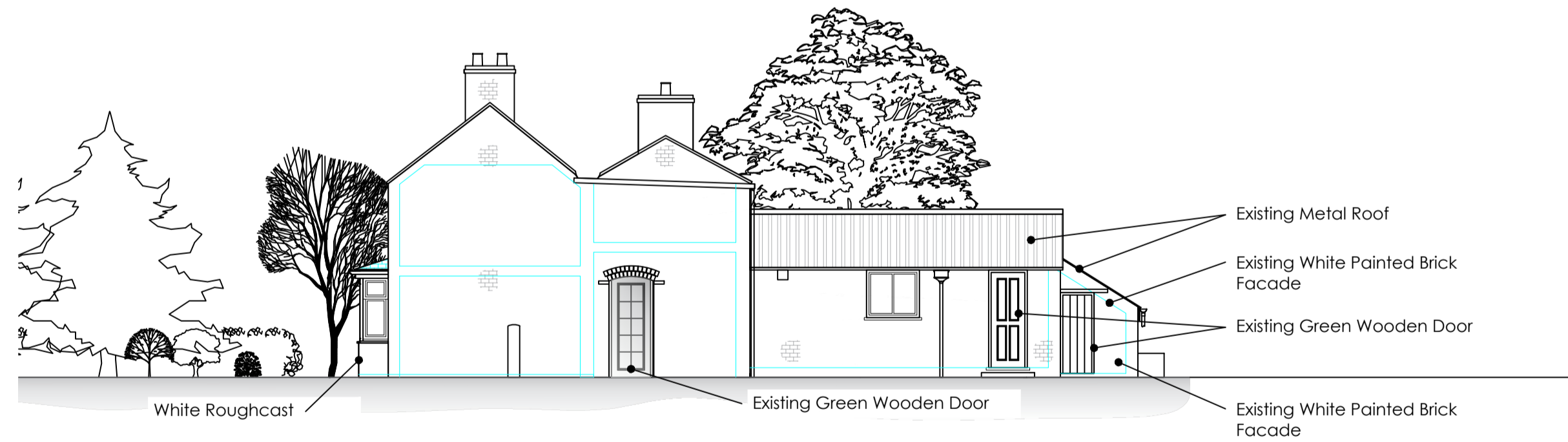
EXISTING EAST ELEVATION 1:100