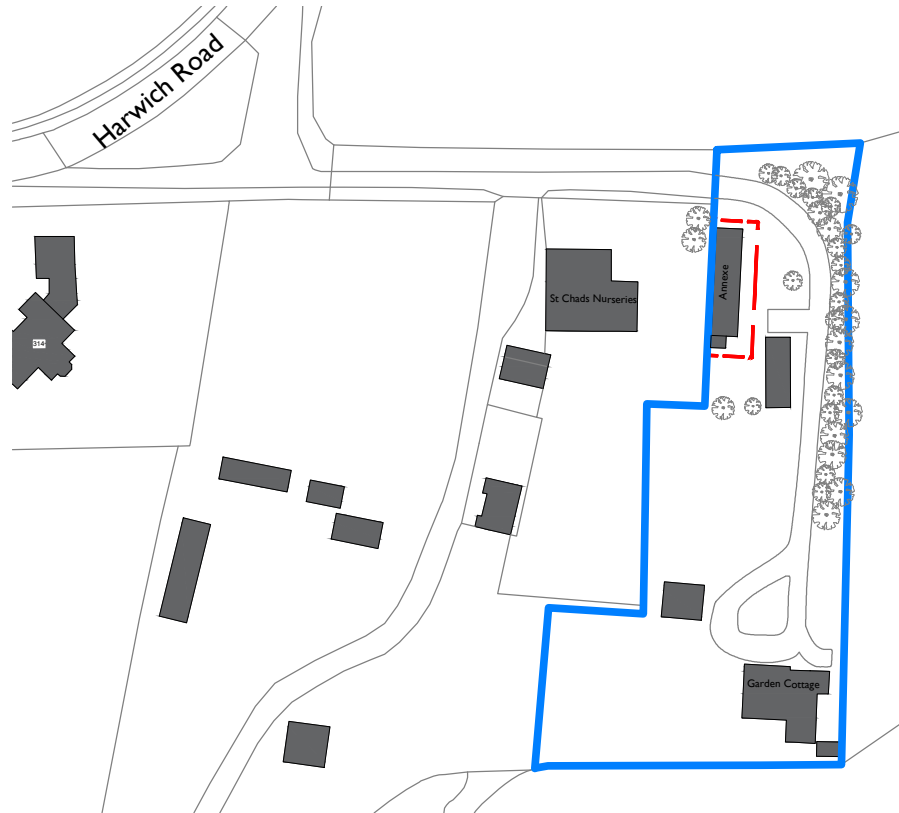
01 Existing Site Plan 100 1:1250