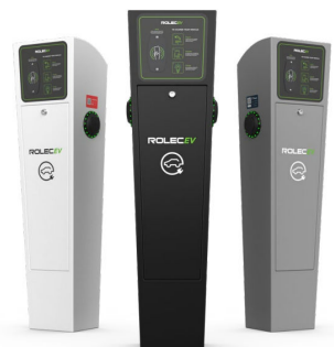
EV Charging Unit Image of proposed charging units. Colour of installed unit to be agreed with the council.

Proposed location for green box, if required. Proposed black EV charging unit Existing parking bays. End two to become EV spaces.