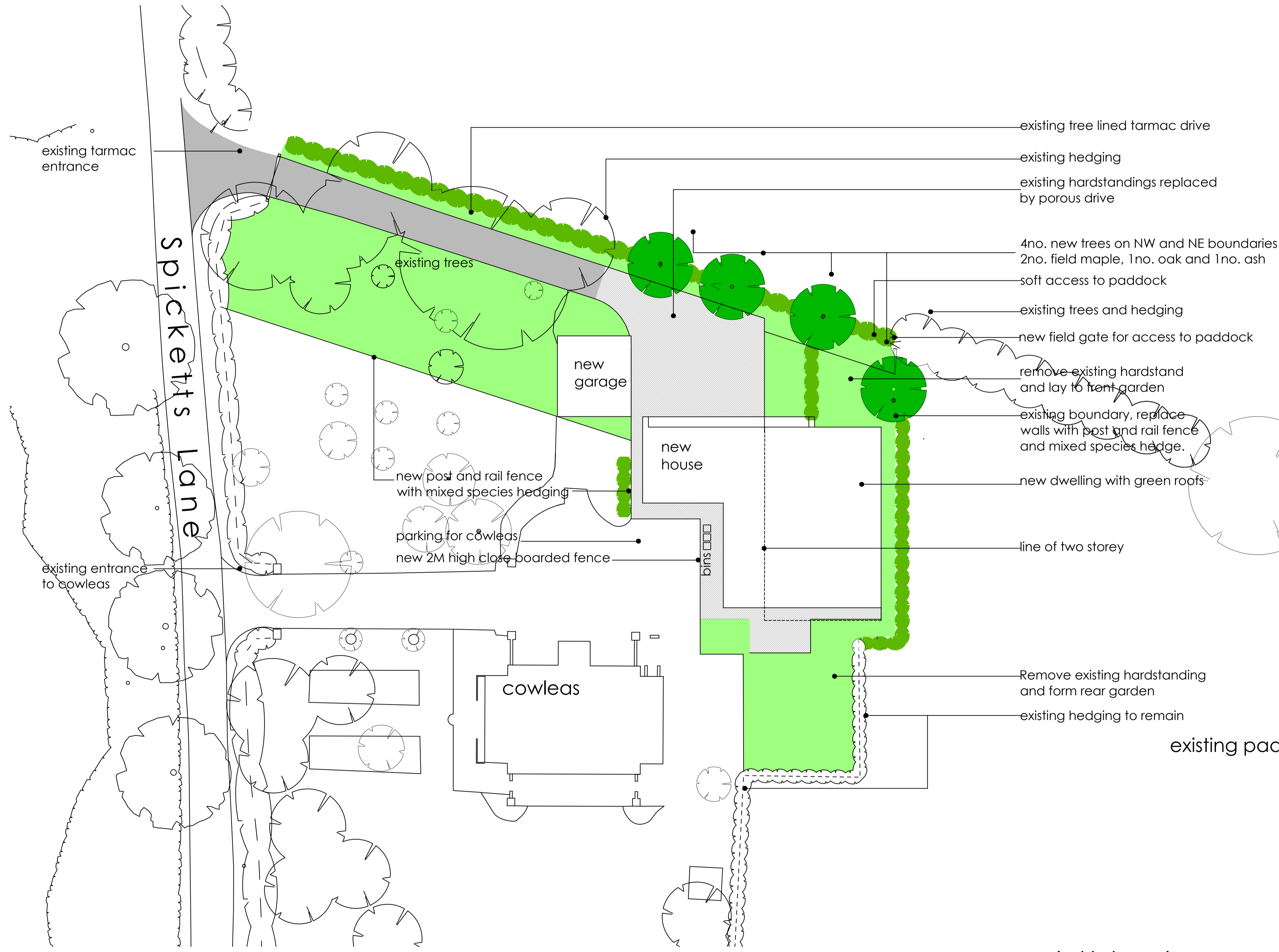
1:200 site plan