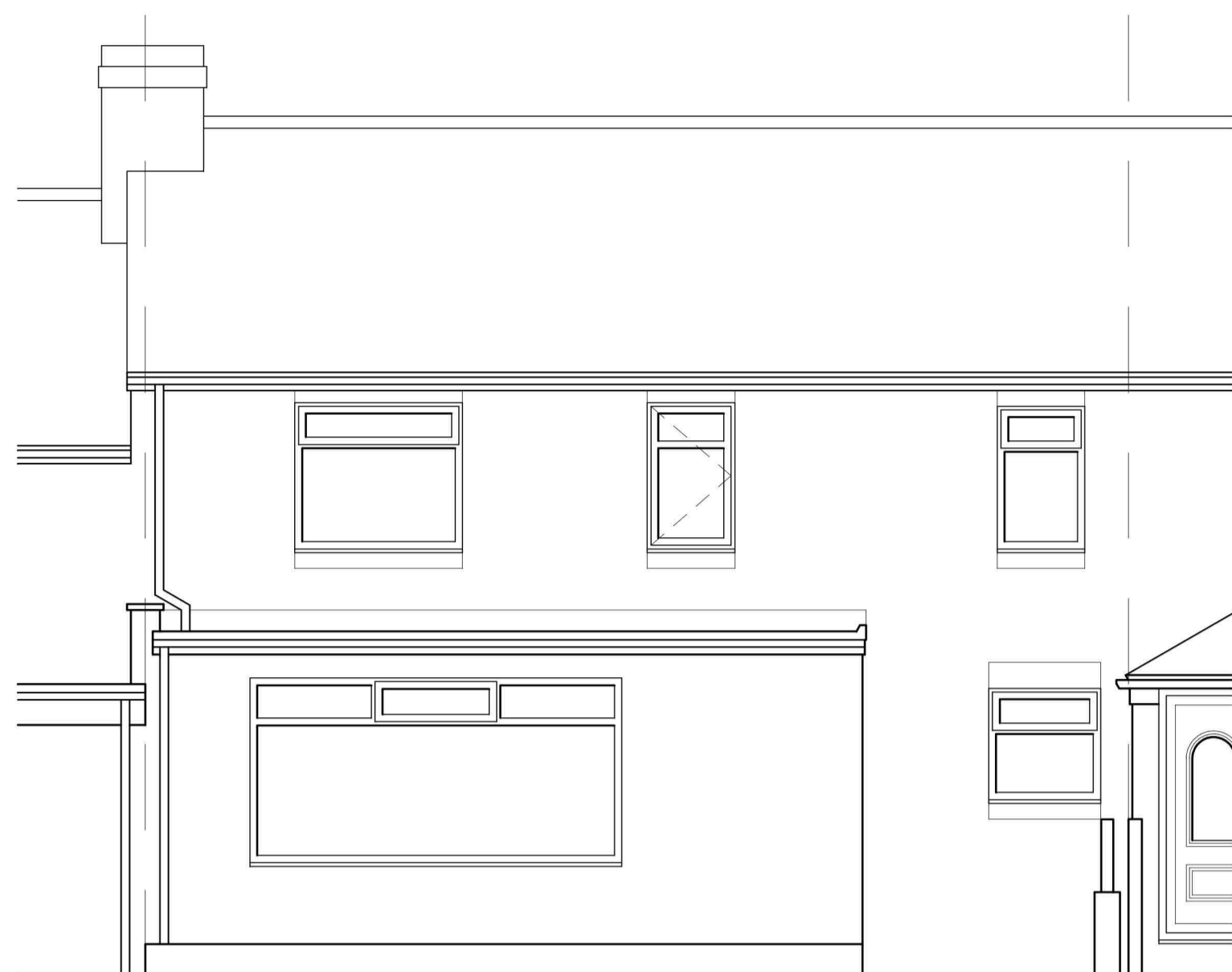
EXISTING FRONT ELEVATION (north west)