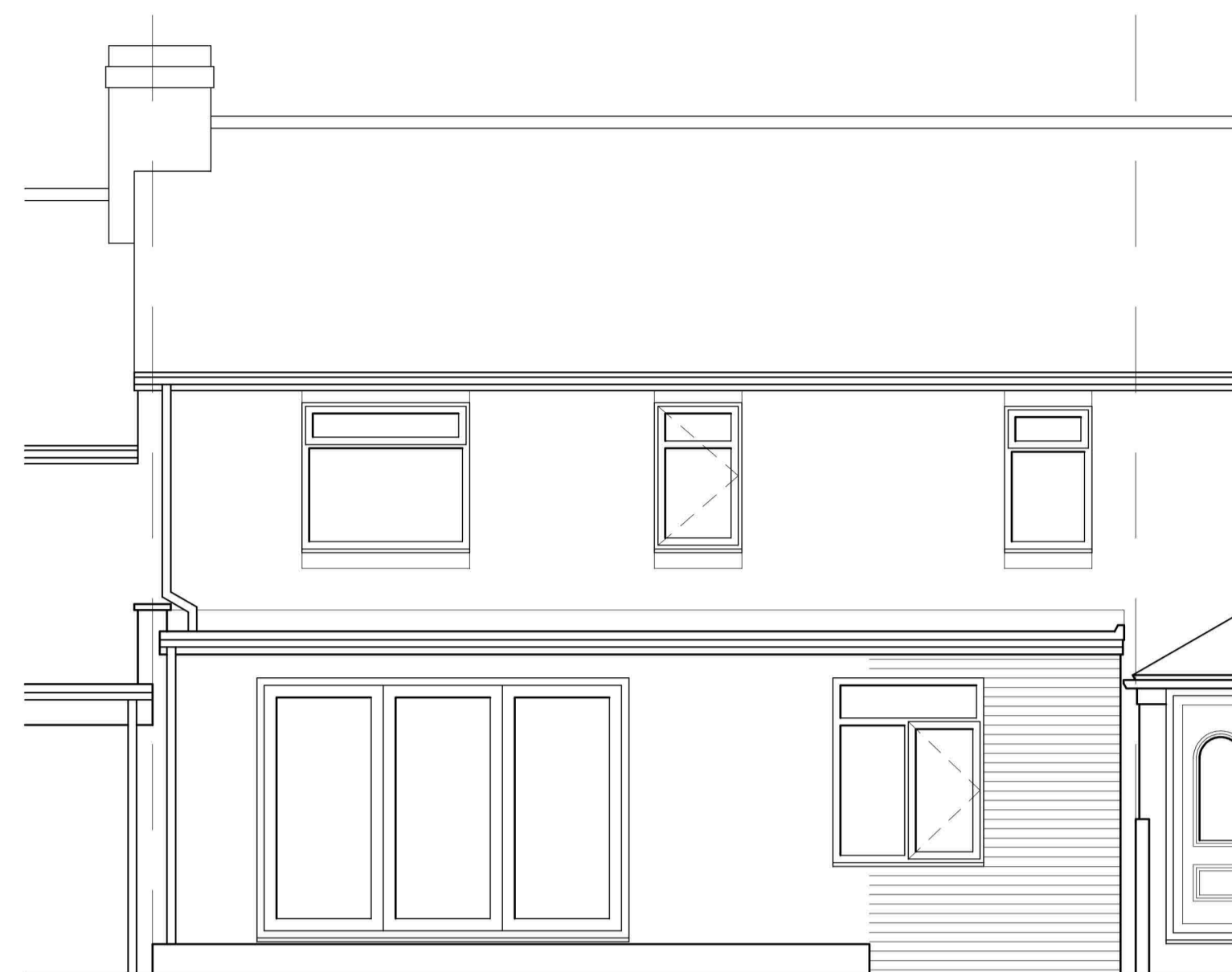
PROPOSED FRONT ELEVATION (north west)