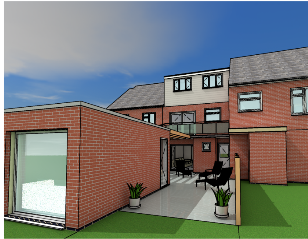
3 Front Perspective - Proposed Scale: Not to scale