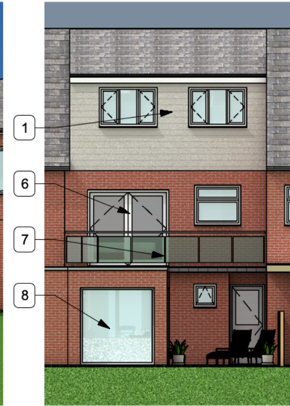
4 South Elevation - Proposed Scale: 1:100