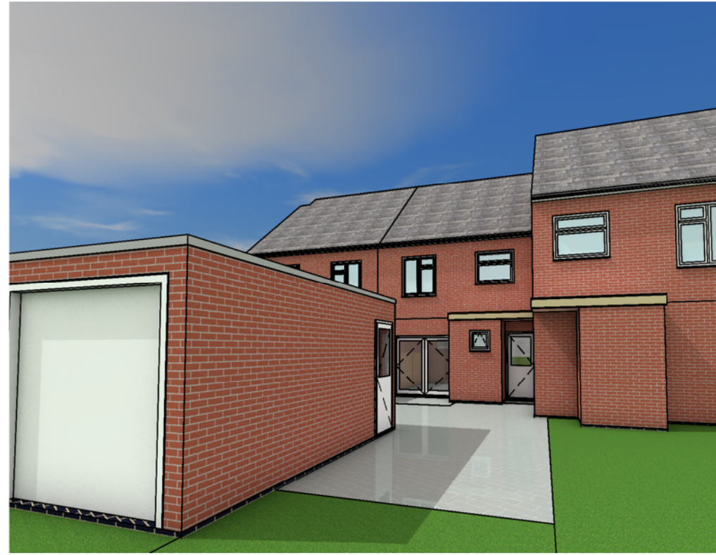
3 Front Perspective - Proposed Scale: Not to scale