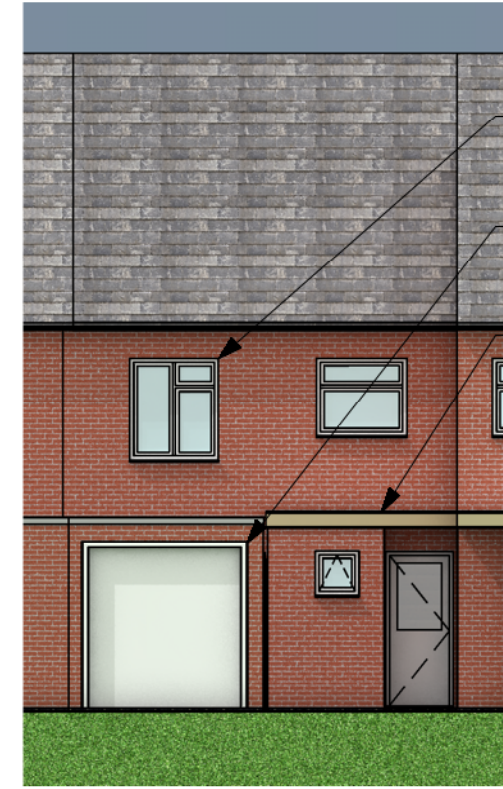
4 South Elevation - Proposed Scale: 1:100