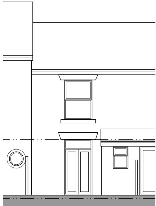
South Facing Rear Elevation

Conway Architectural Design shall have no responsibility for any use made of this document other than for that which it was prepared and issued. This drawing should not be scaled. Work to figured dimensions only. All dimensions and levels to be checked on site. No building work is to be started until all relevant approvals are in place. Any discrepancies should be reported to Conway Architectural Design. This drawing should not be reproduced without written permission from Conway Architectural Design. Standard Building Regs Notes are to be provided by Conway Architectural Design prior to a building regs application being submitted.