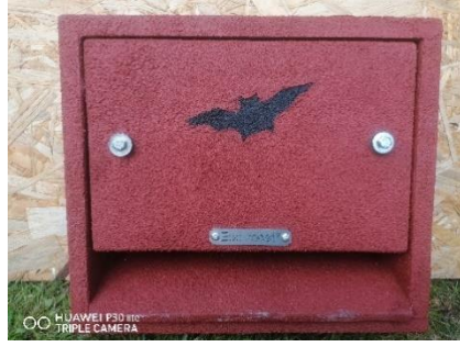
Eco-Roost Double Chamber Bat Box