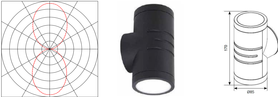
Figure 2- Proposed light fixture- 5.9w Reef LED CCT Directional Wall Light

In accordance with the Bat Conservation Trust's publication Bats and artificial lighting (BCT, 2018) light pollution by artificial lighting will be kept to a minimum and light spillage avoided. The following specific mitigation will be put in place to minimize disturbance to bats caused by the lighting of the site. The following mitigation strategies have been taken from Bat Conservation Trust Landscape and Urban Design for Bats and Biodiversity (Gunnell et al., 2012) and other referenced sources: