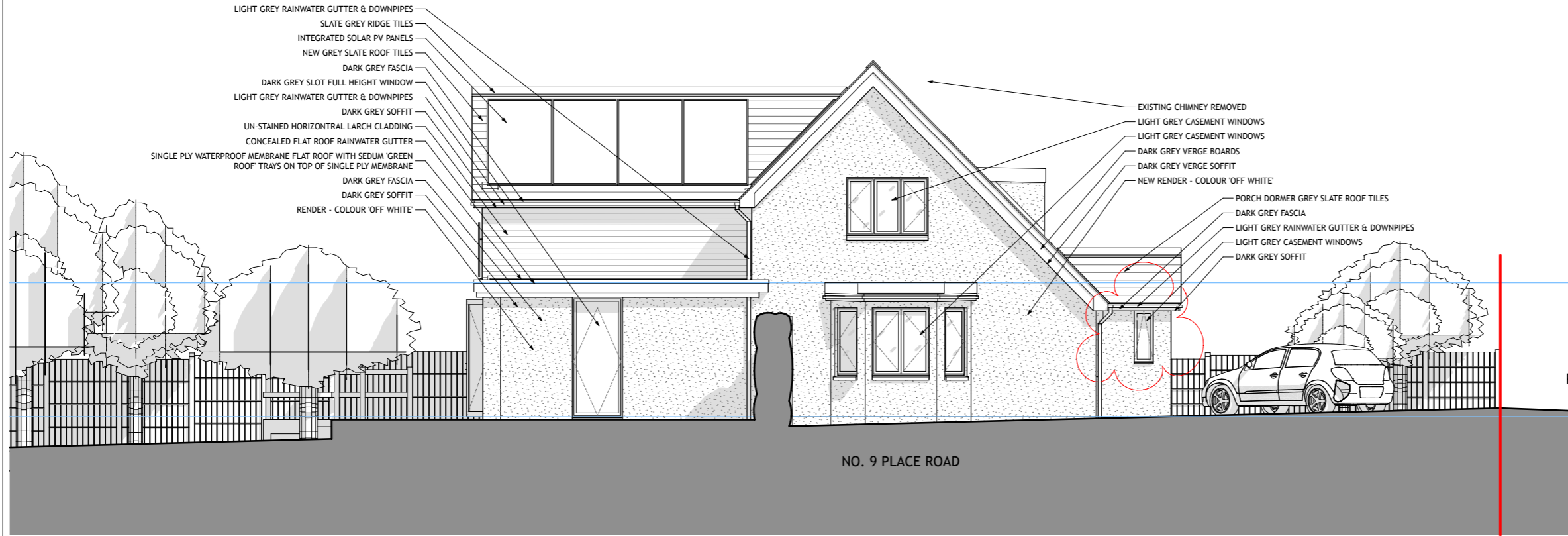
PROPOSED LEFT SIDE ELEVATION (SOUTH EAST) 1:100 @ A3 SIZE

NOTE: TREE & SHRUB POSITIONS INDICATIVE ONLY