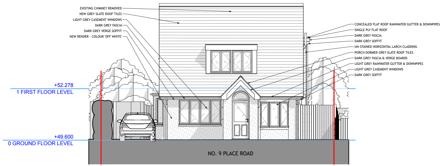
PROPOSED FRONT ELEVATION (NORTH EAST) 1:100 @ A3 SIZE