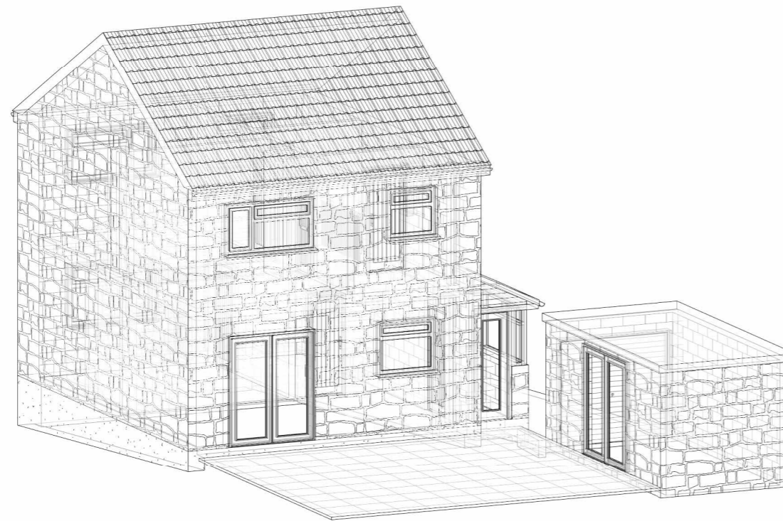
3 3D - 3