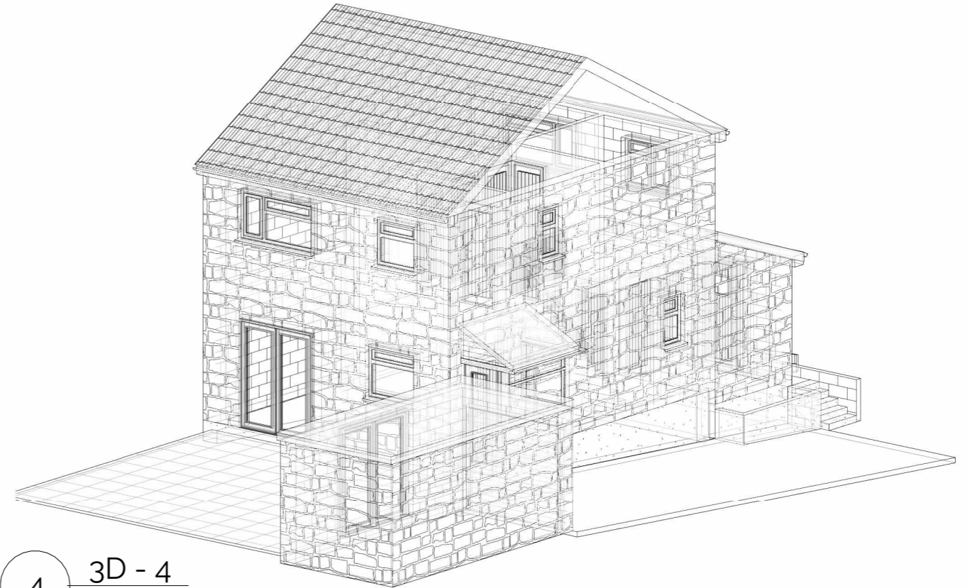
4 3D - 4