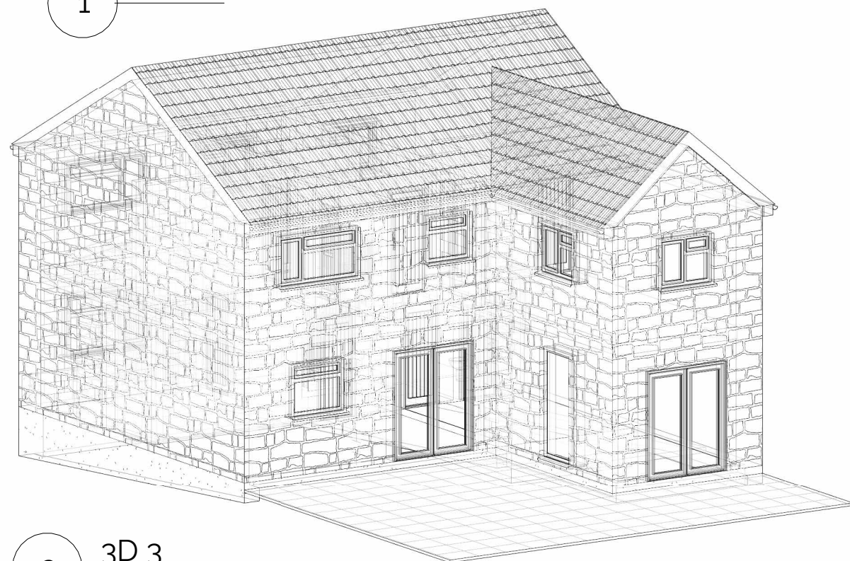
3 3D 3