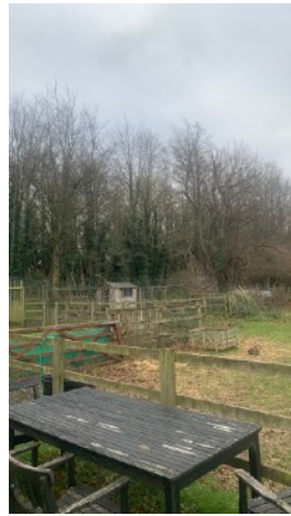
T's 2 & 3