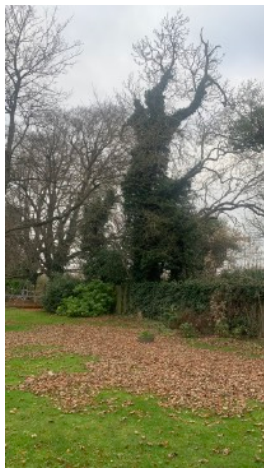
T's 8- 15 along roadside