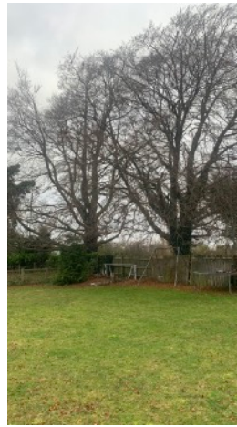
T's 8 & 9 & Severe ivy encroachment