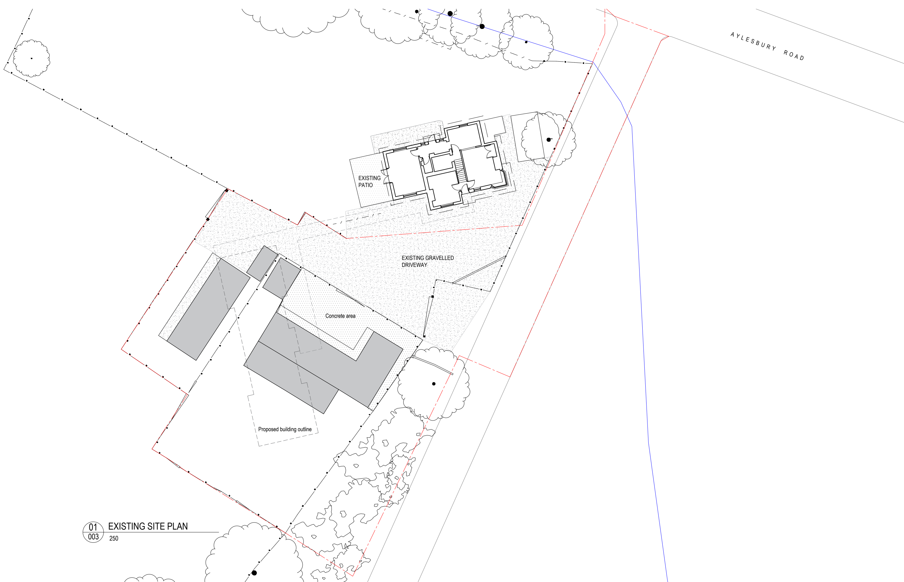
01 EXISTING SITE PLAN 003 250

ALL DIMENSIONS MUST BE CHECKED ON SITE INFORM THE ARCHITECT OF ANY DISCREPANCIES PRIOR TO CONSTRUCTION PLOT SIZE: A3