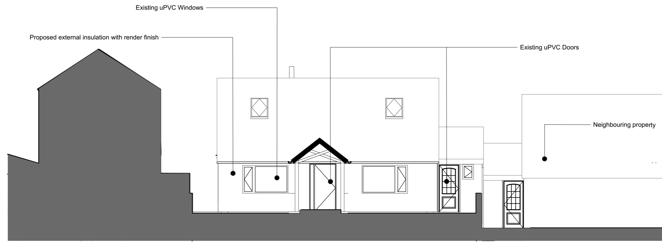
1. Proposed North Elevation