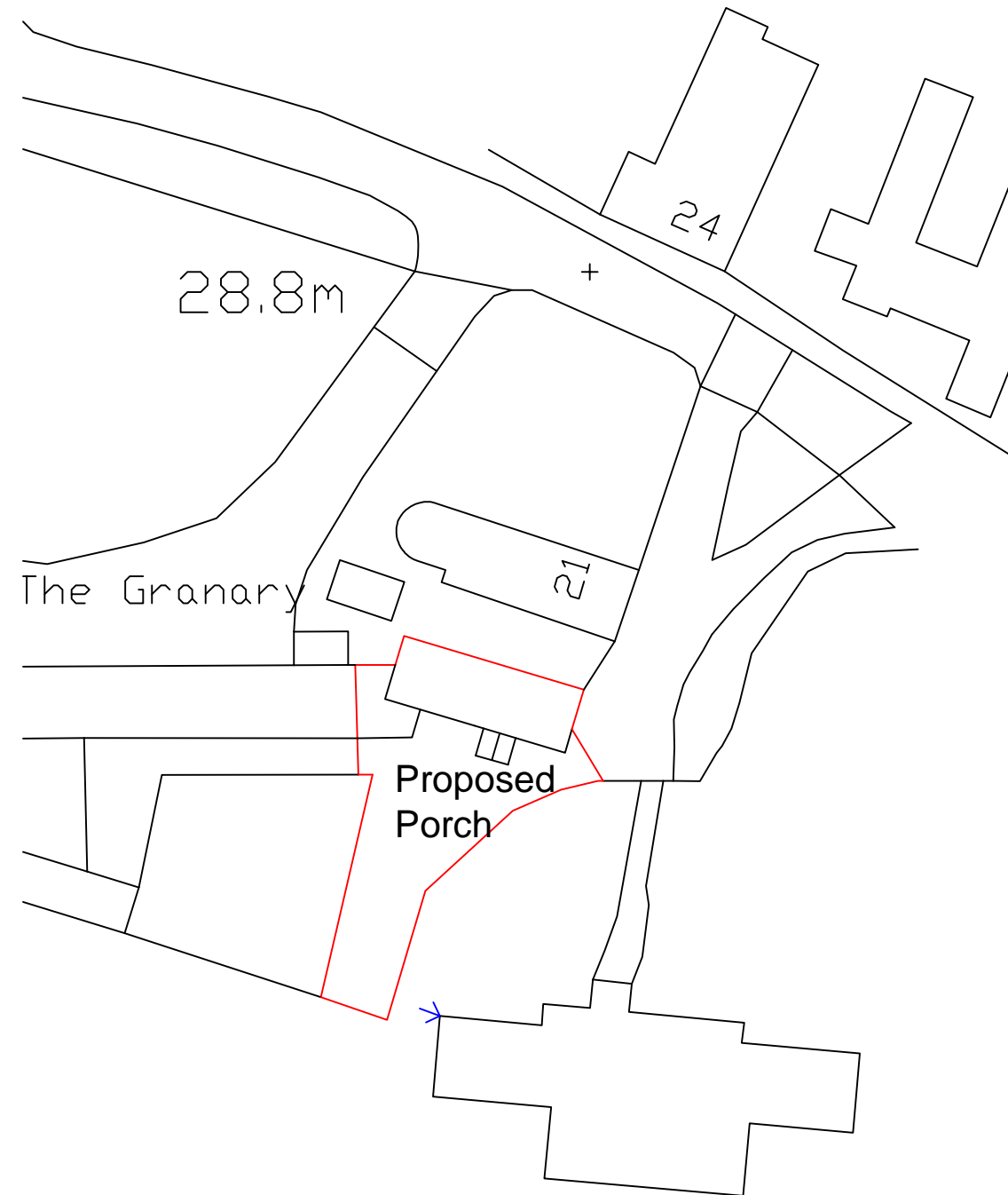
Block Plan (Scale 1:500)