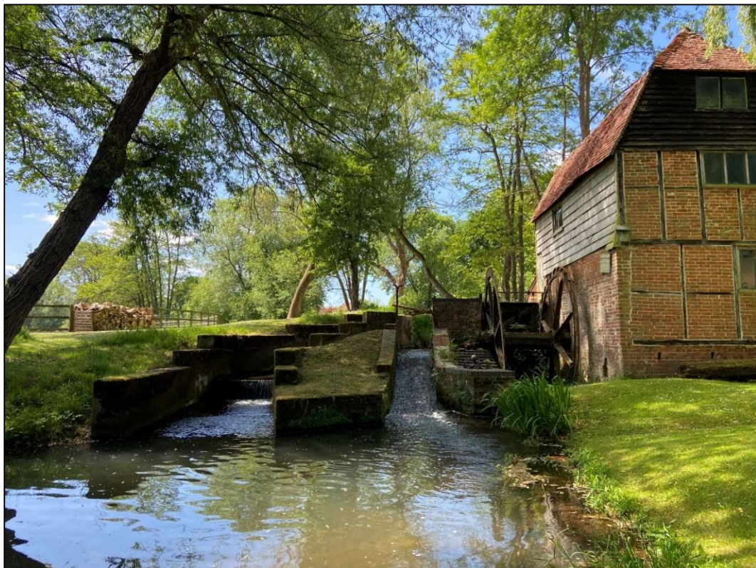
Above: Pilcot Mill Weir, existing conditions

Following sign off of planning applications, flood risk modelling and regulatory permissions, the fish pass will take approximately 1-2 weeks to install.