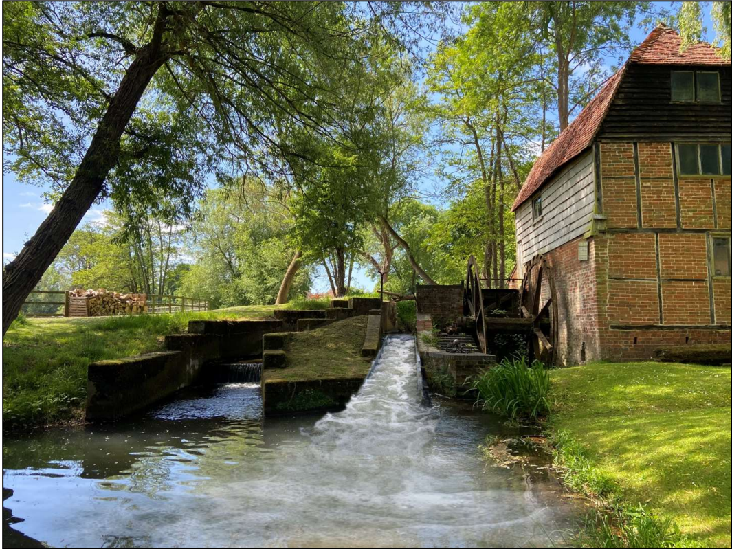
Above: Pilcot Mill with proposed fish pass