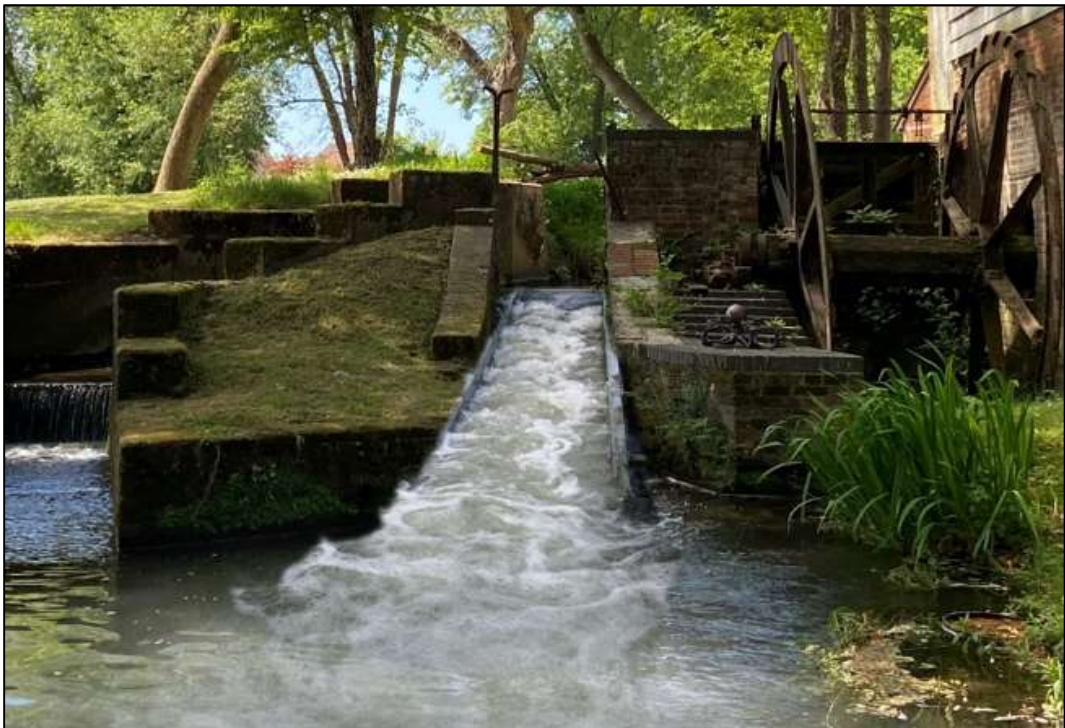
Above: Pilcot Mill with proposed fish pass