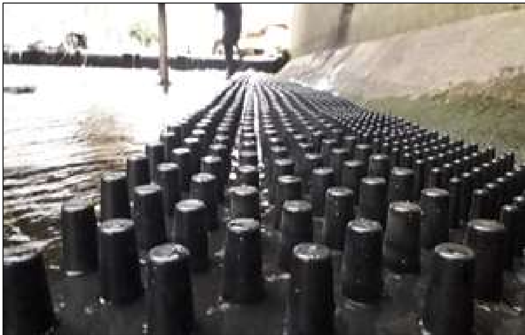
Above: Eel tiles providing continuous climbing substrate