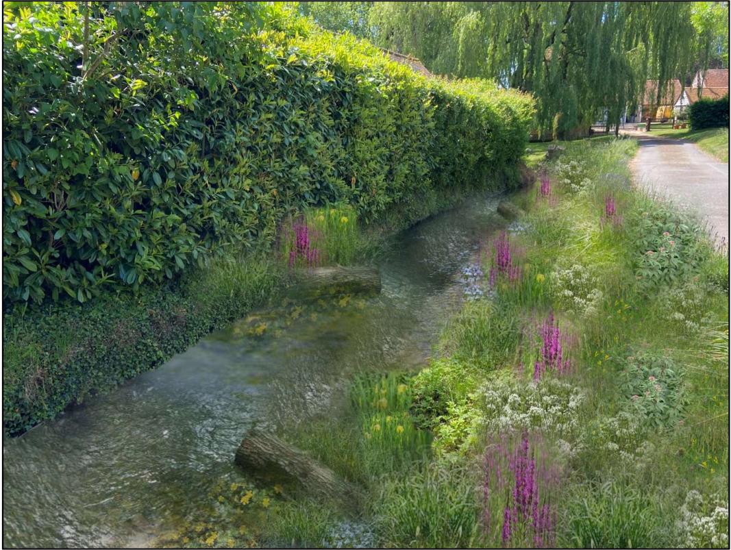
Above: Downstream of weir with proposed improvements