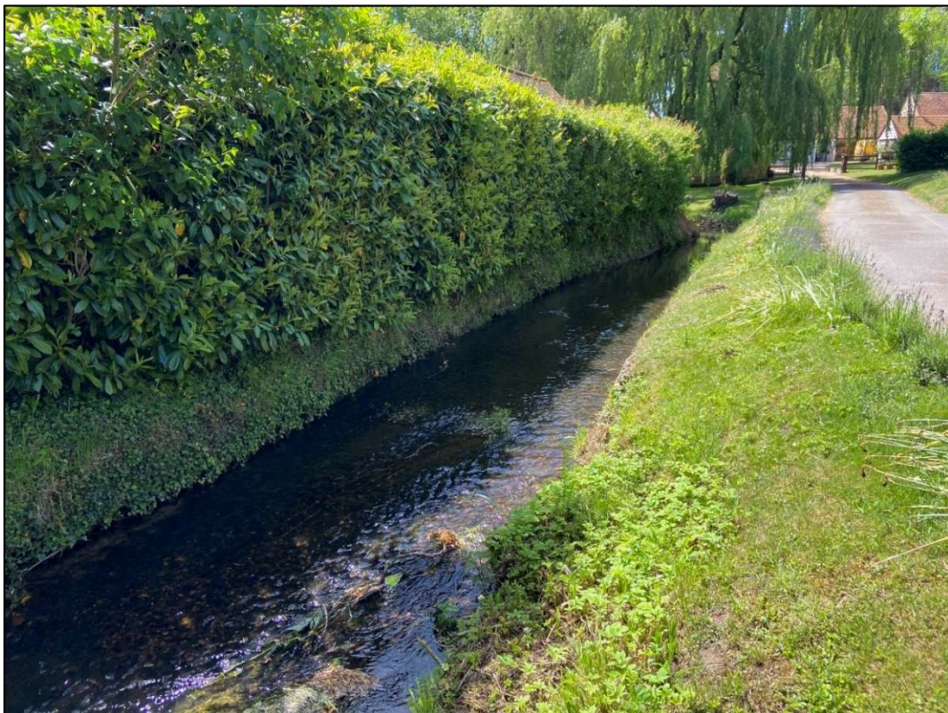
Above: Downstream of weir (current conditions)