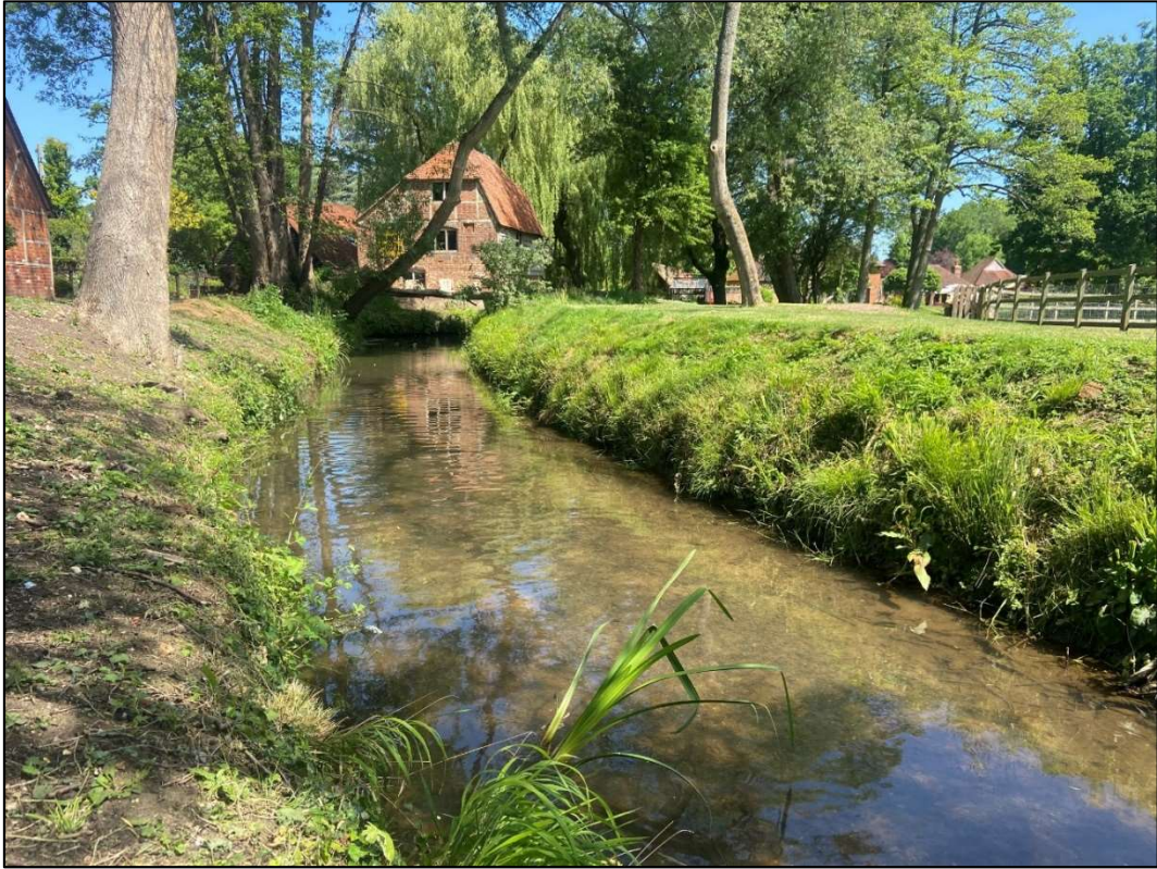
Above: Upstream of weir (current conditions)