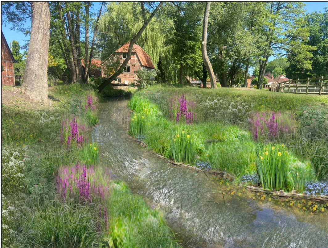
Above: Upstream of weir with proposed improvements