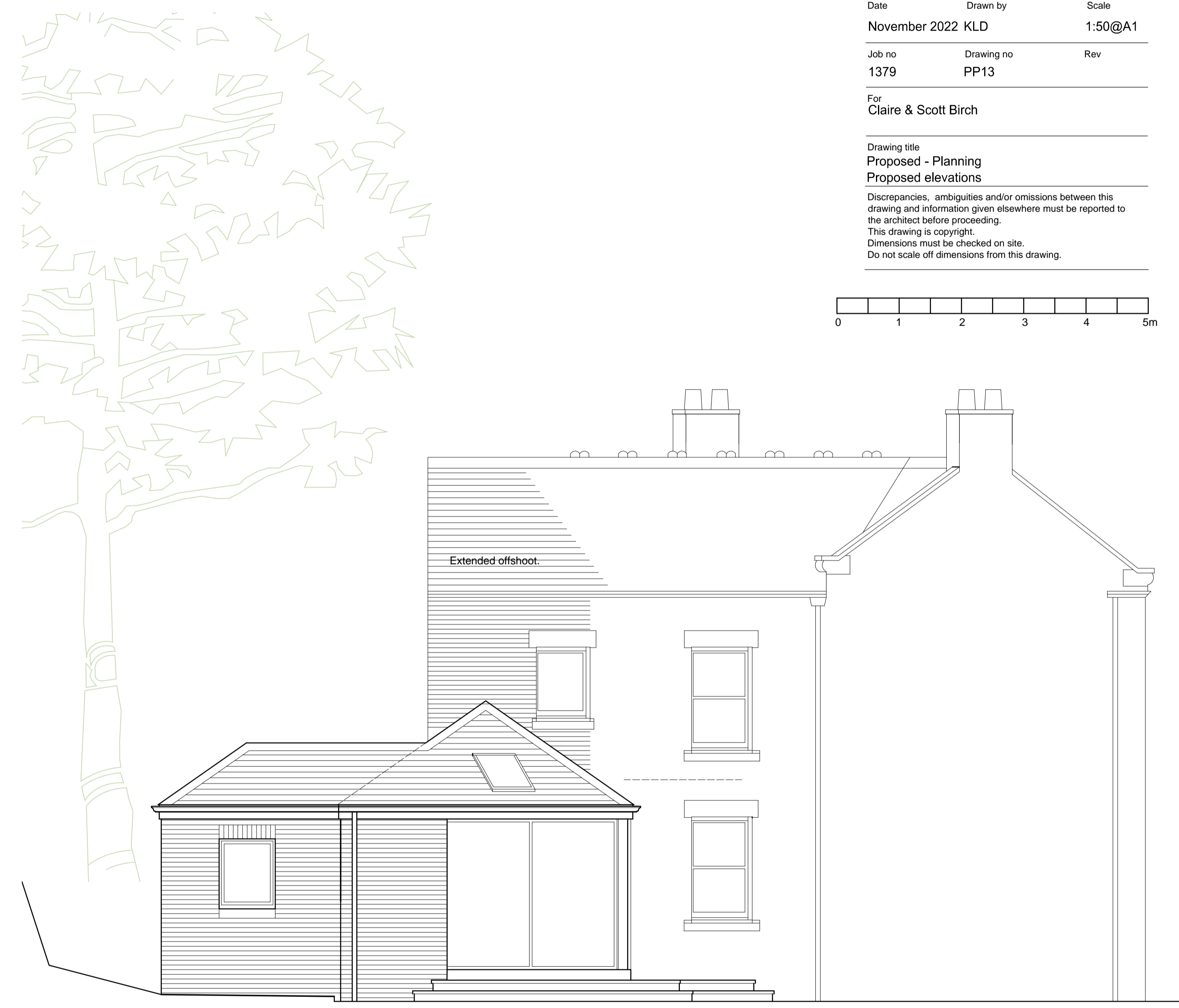
PROPOSED NORTH WEST ELEVATION BB

General construction of extended offshoot: Foundations as general detail of RC insitu ground beam built off minipiles. Brickwork external cavity walling to match existing. Slated roof.