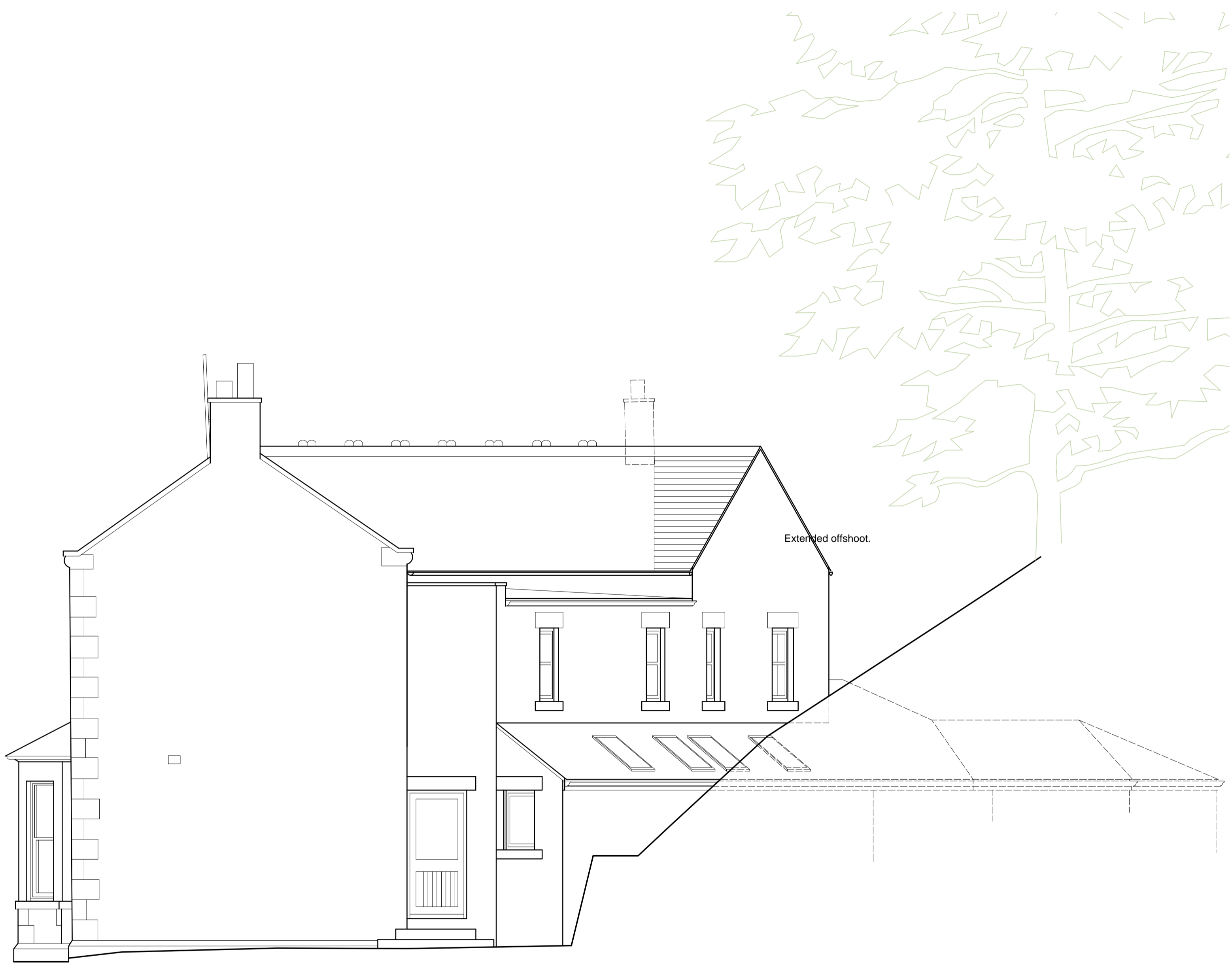
PROPOSED SOUTH EAST ELEVATION CC