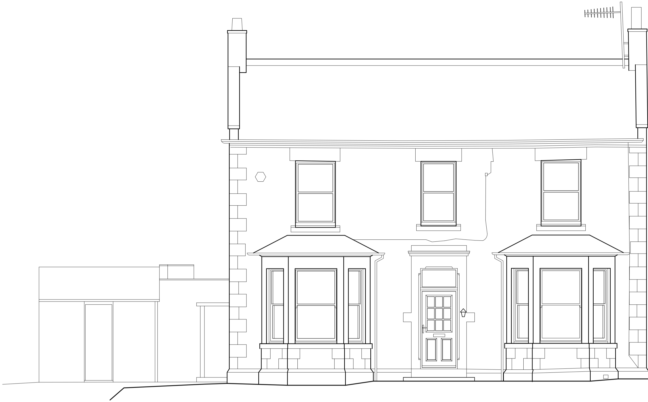
South West Site Elevation