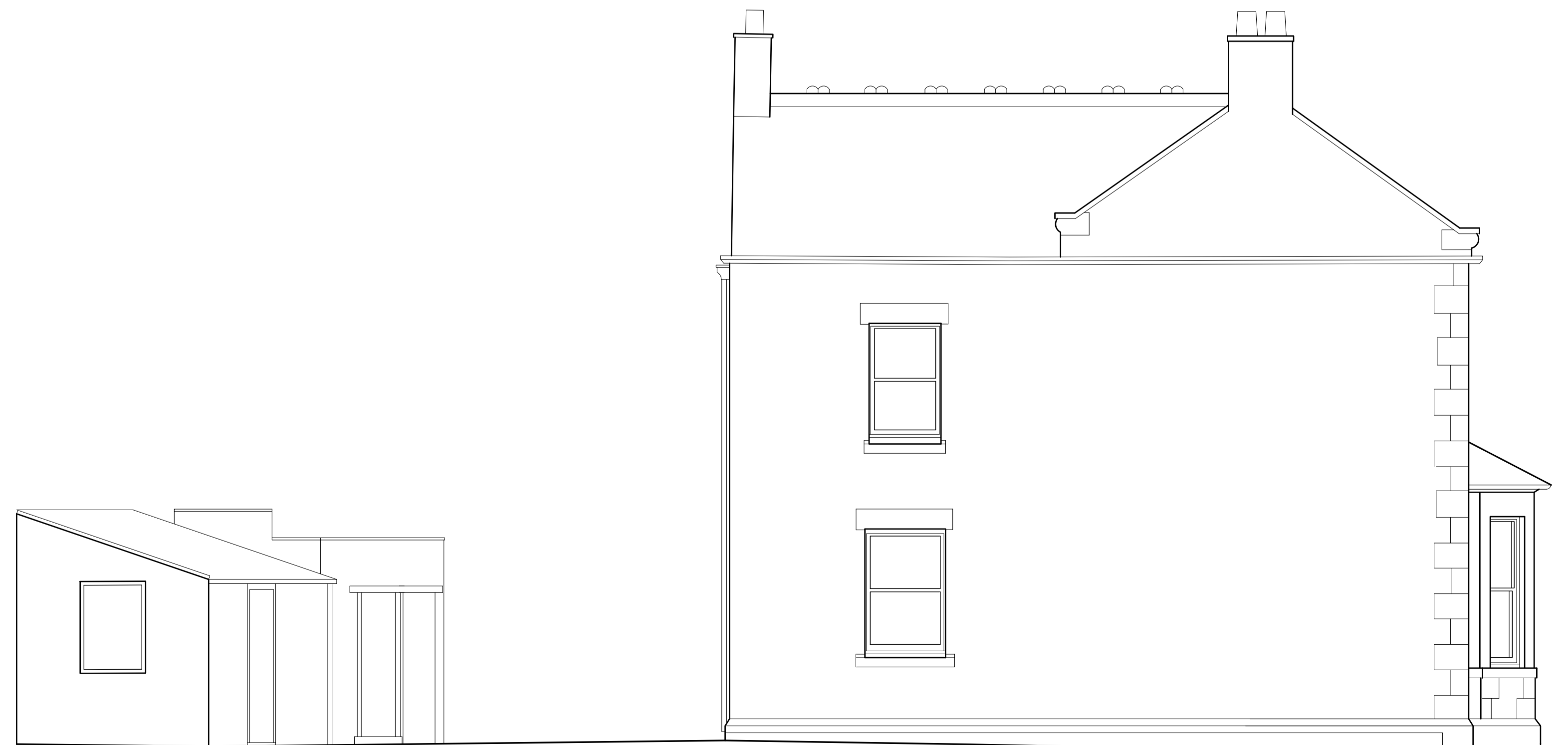
North West Site Elevation