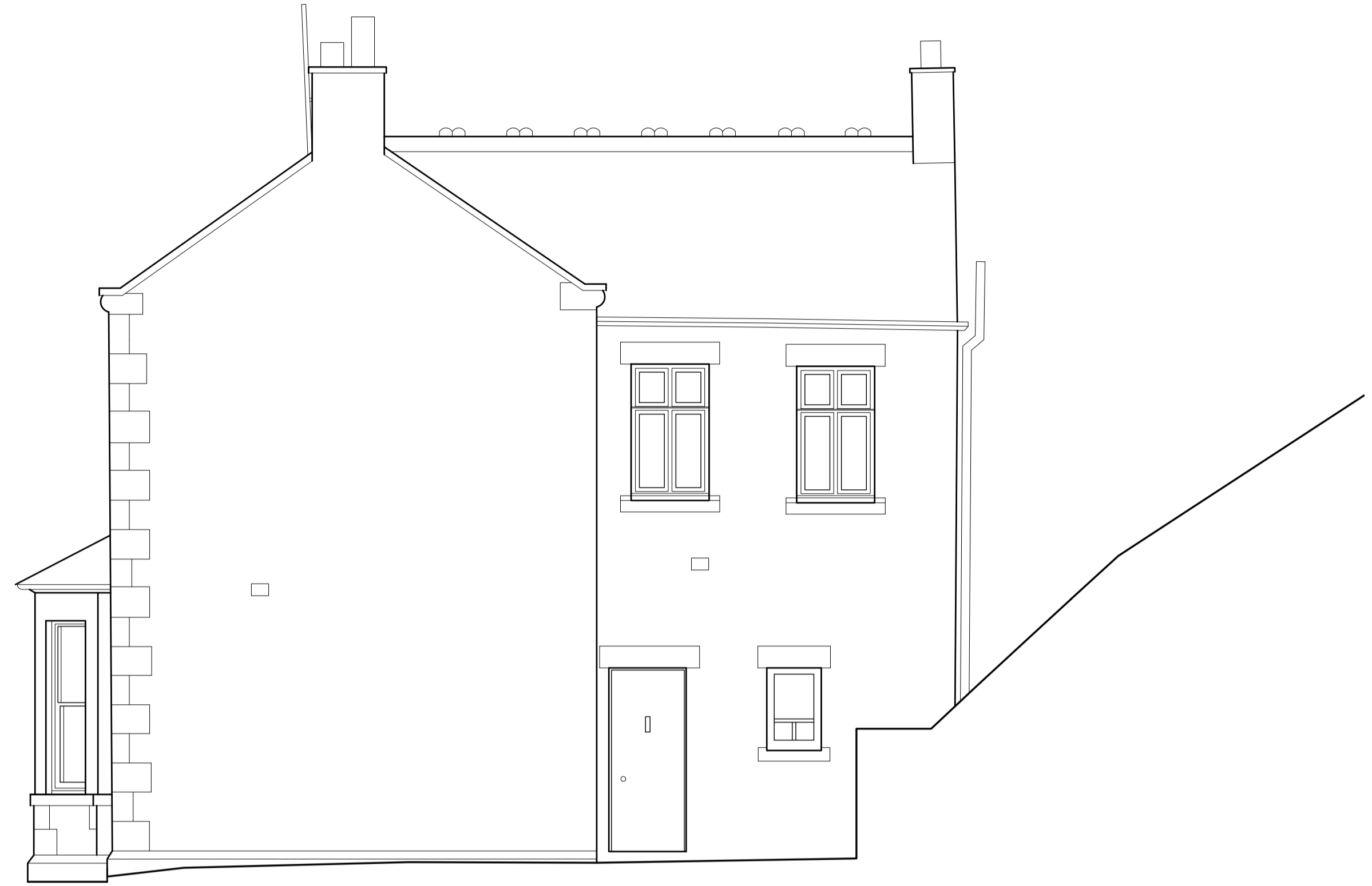
South East Site Elevation