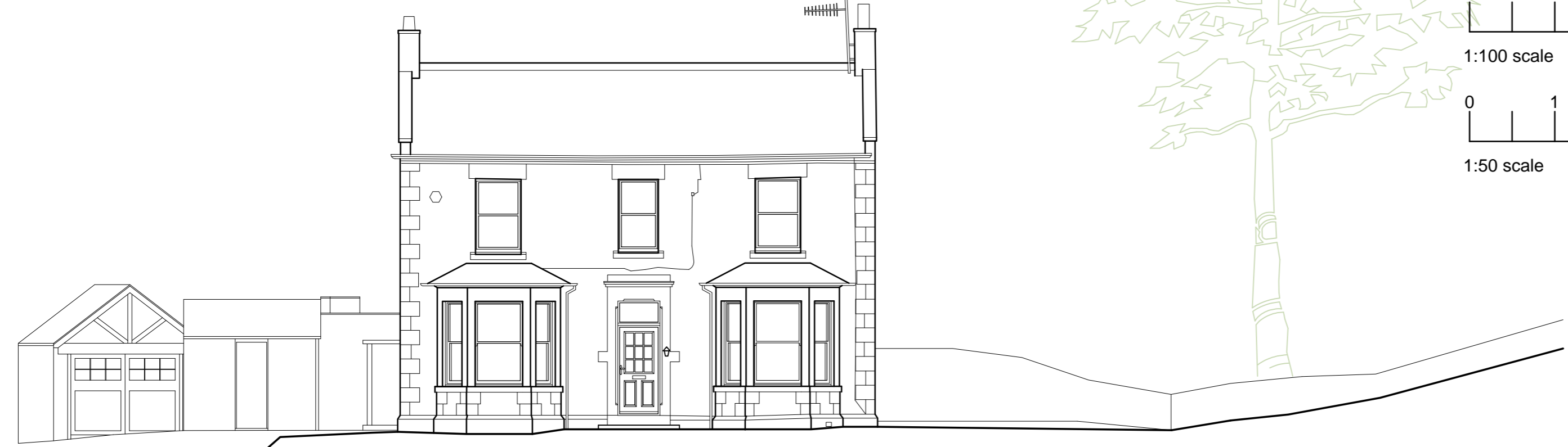
South West Site Elevation (1:100)

REV A KLD 31 March 2023 Scale bars added