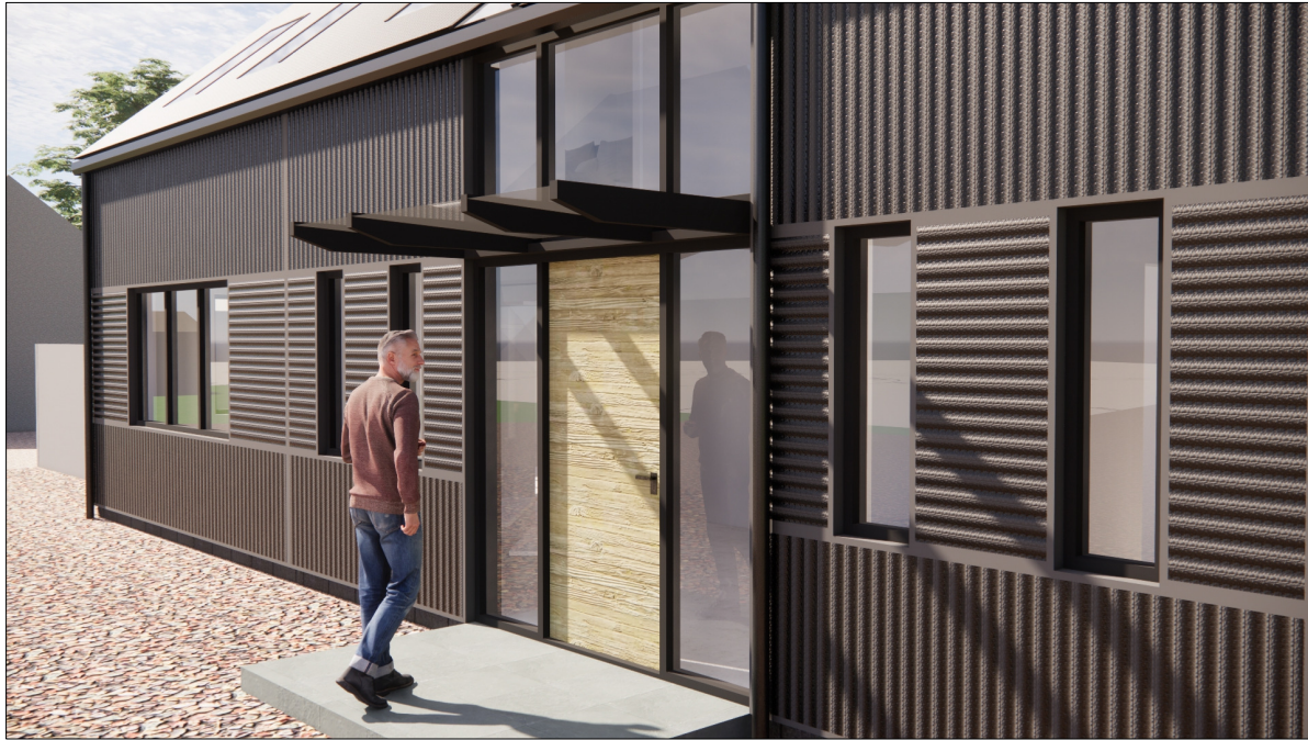
DETAIL VIEW 1