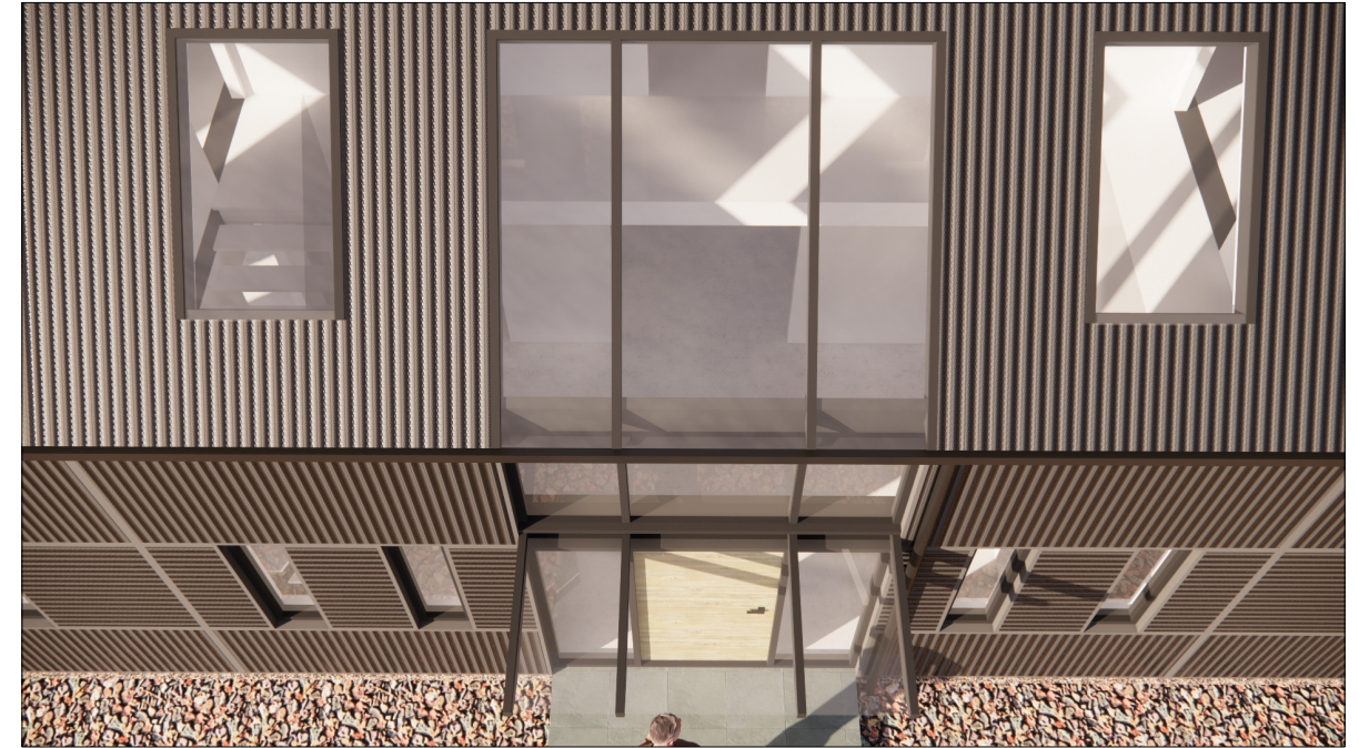
DETAIL VIEW 2