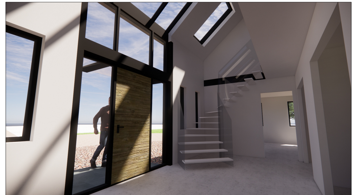
DETAIL VIEW 4