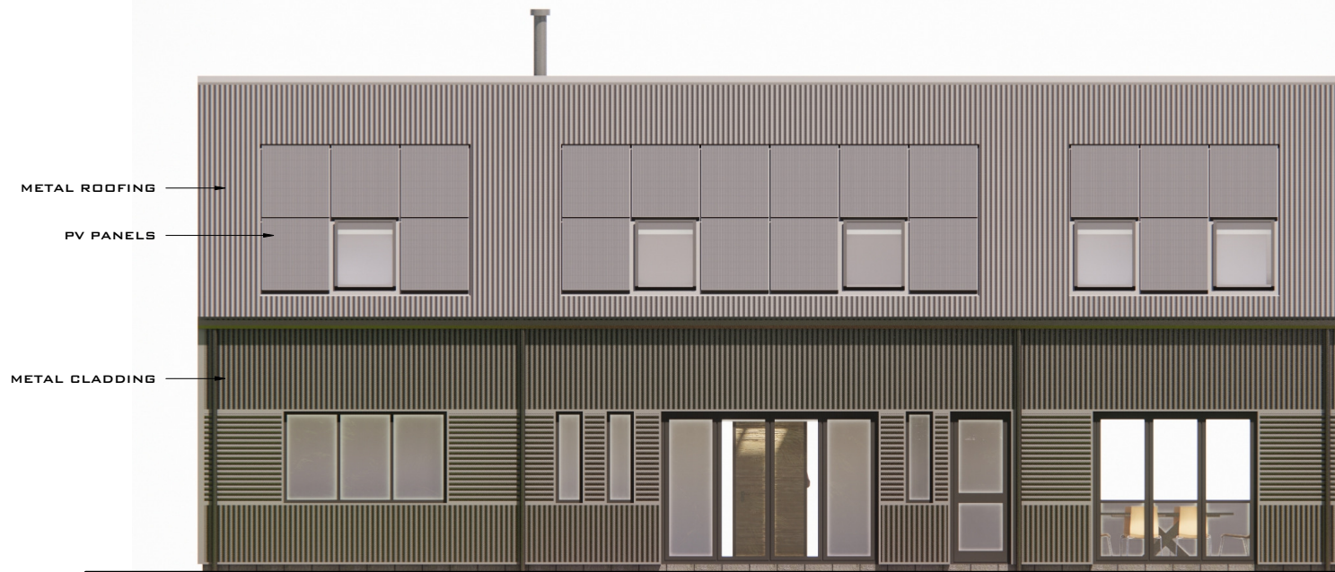
REAR ELEVATION (SW)