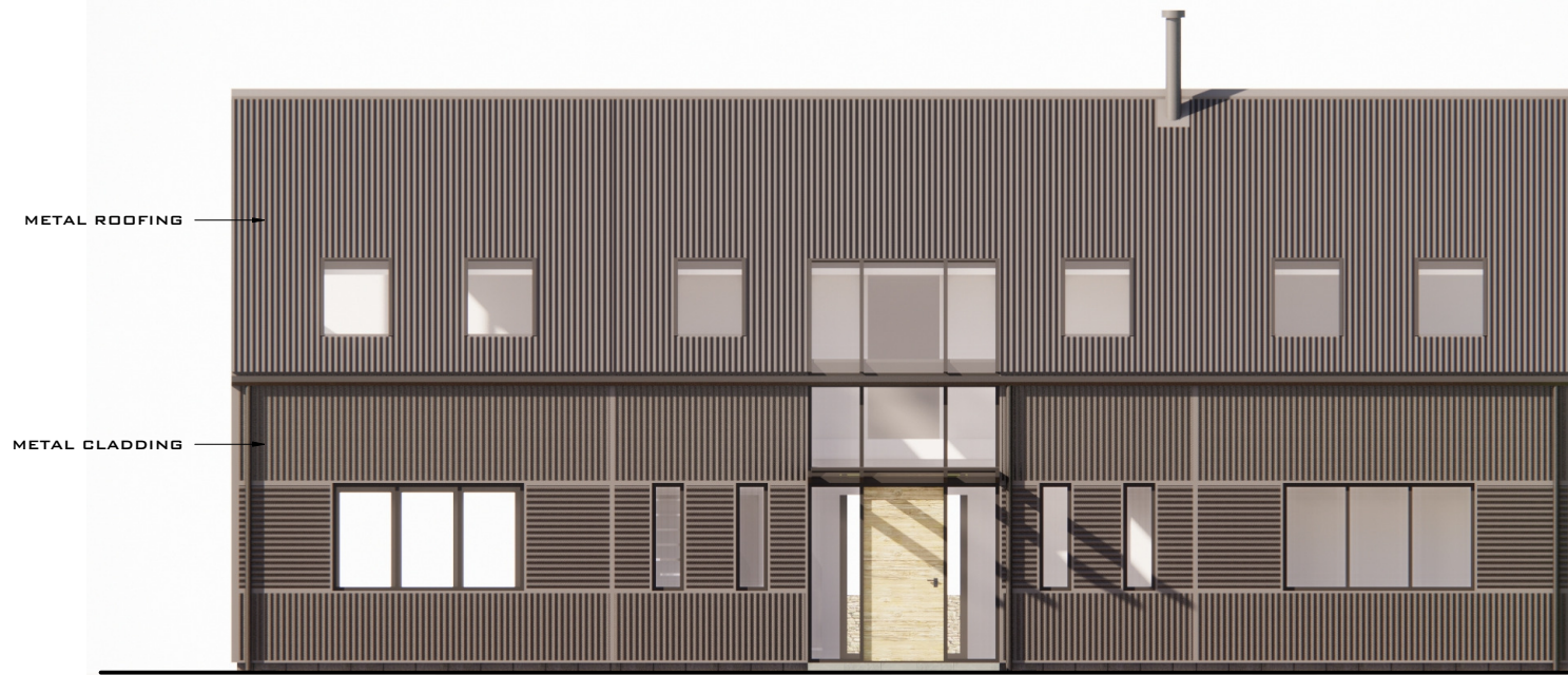
FRONT ELEVATION (NE)