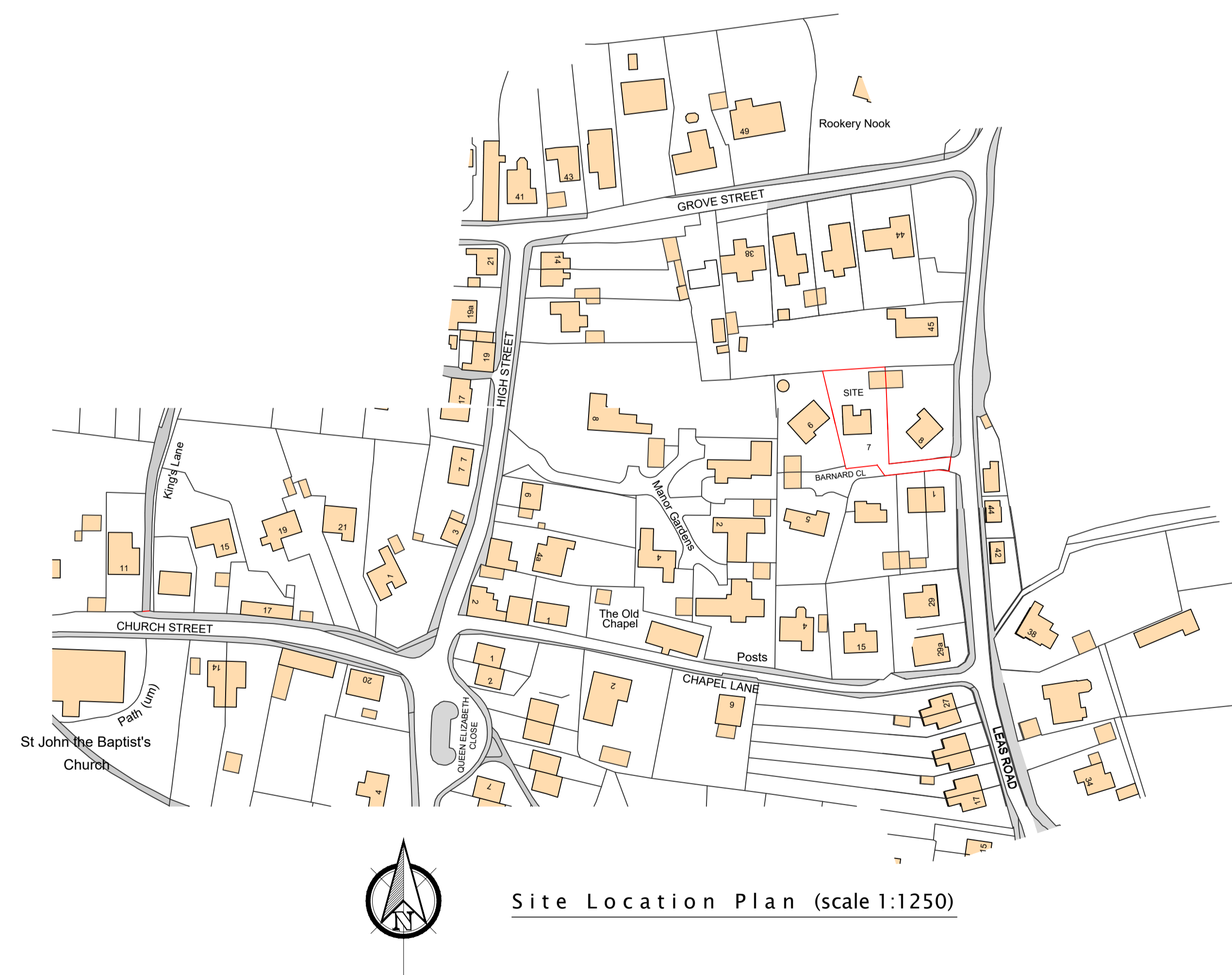
Site Location Plan (scale 1:1250)