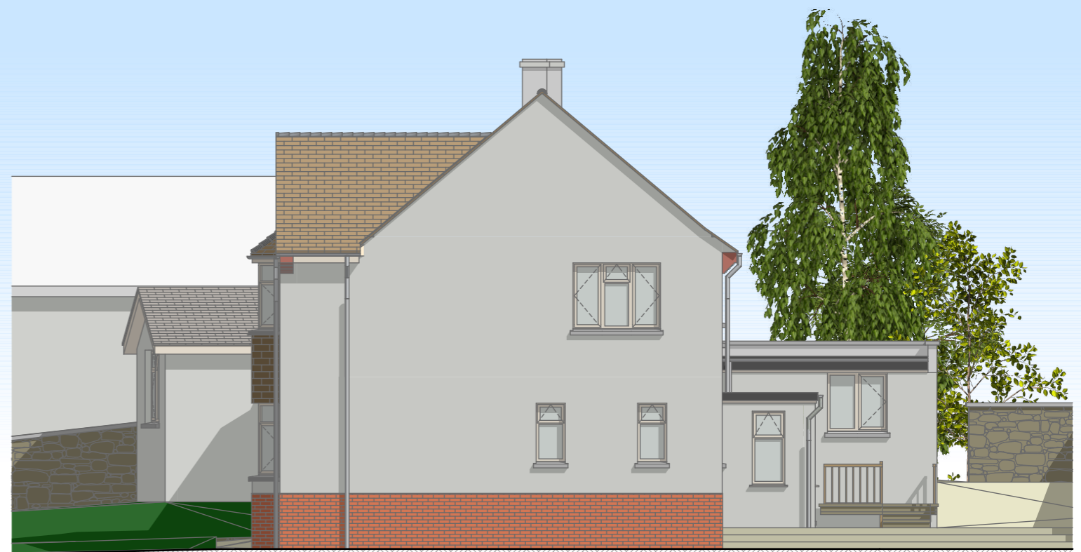
E-02 North Elevation Existing 1:100

Layout Title A3 Elevations Existing 1-100