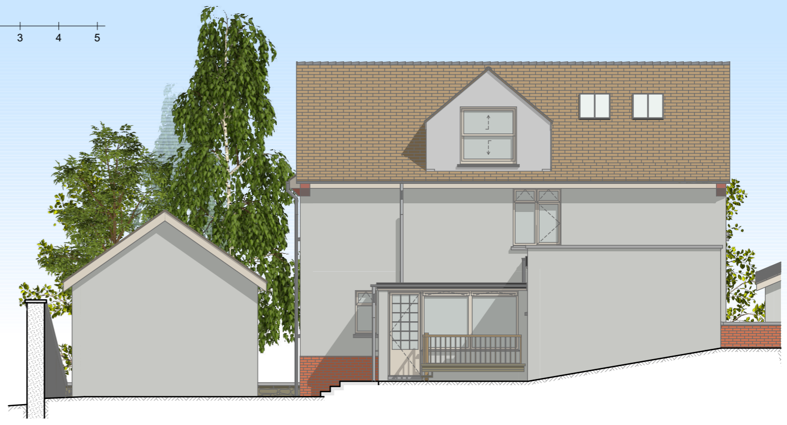
E-01 West Elevation Proposed 1:100