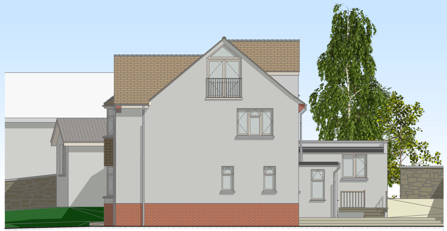
E-02 North Elevation Proposed 1:100

Layout Title A3 Elevations Proposed 1-100