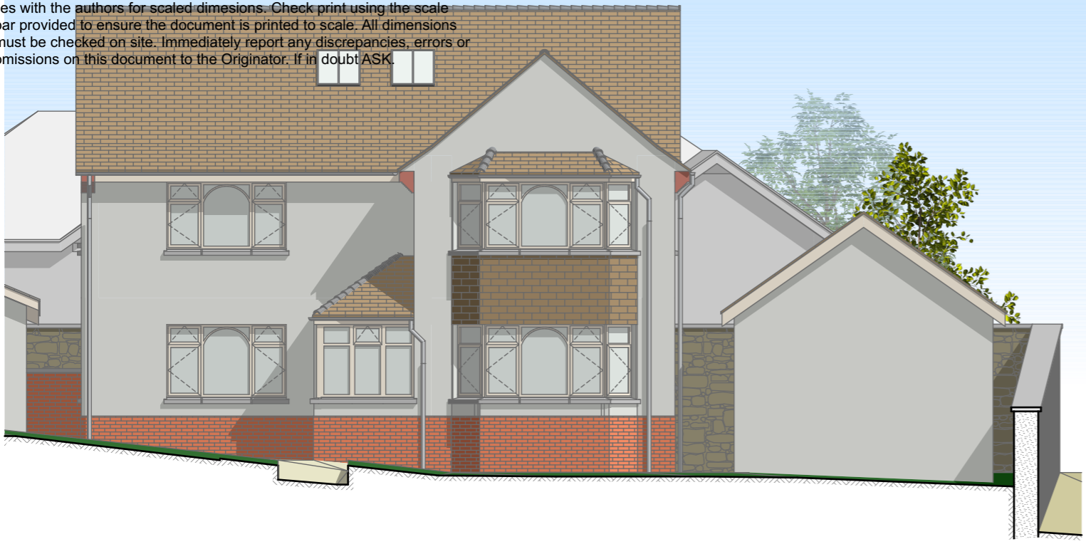
E-03 East Elevation Proposed 1:100