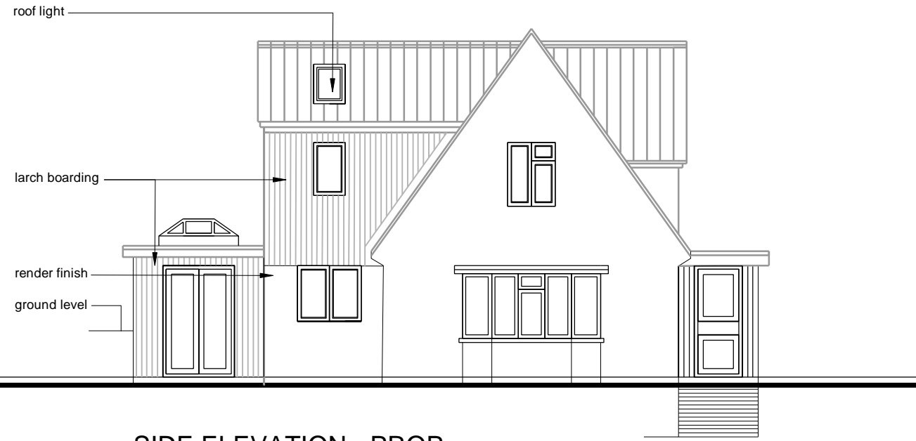
SIDE ELEVATION - PROP