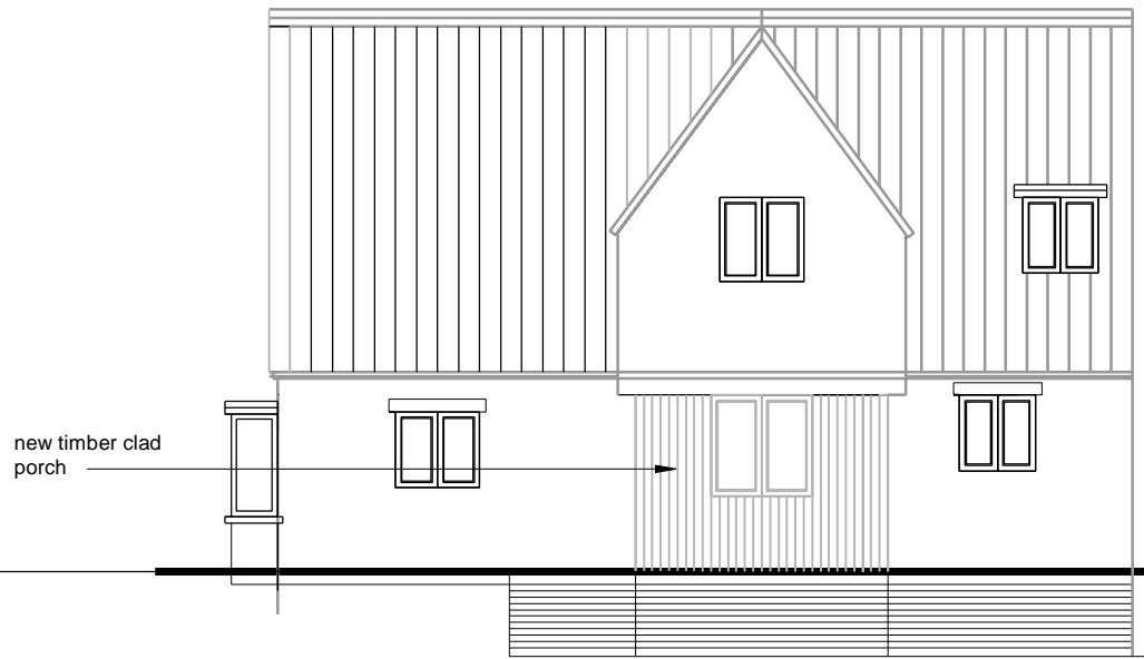
FRONT ELEVATION - PROP