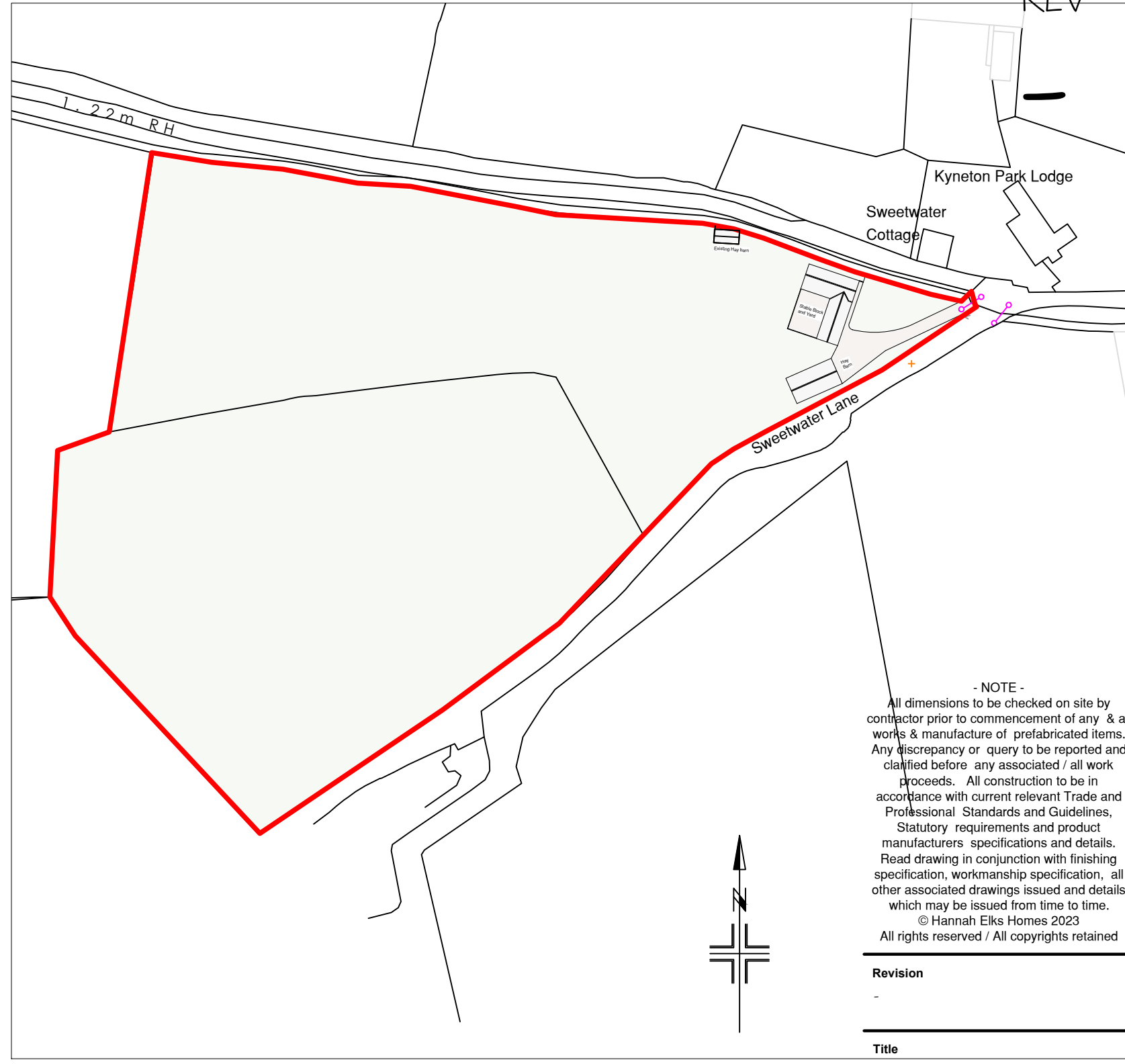
Proposed Location Plan, scale 1:500 @ A3