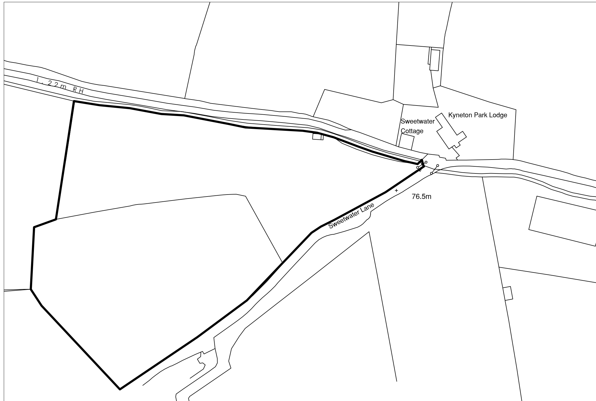
Existing location plan, scale 1:1250 @ A3