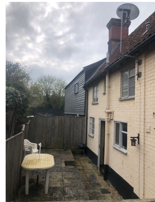
IMAGE 3 showing rear elevation with private amenity space