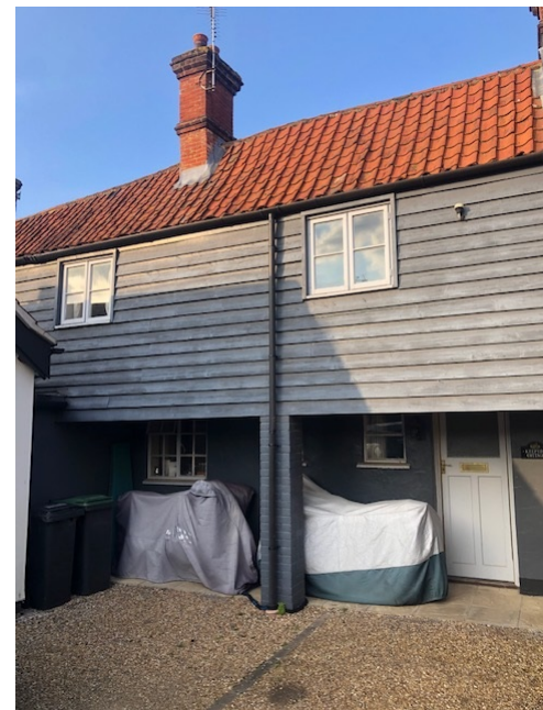
IMAGE 1 showing internal elevation with cycle storage

all required changes to create proposed dwelling are internal no variations to elevations required