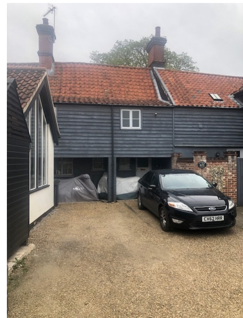
IMAGE 2 showing internal elevation with car parking