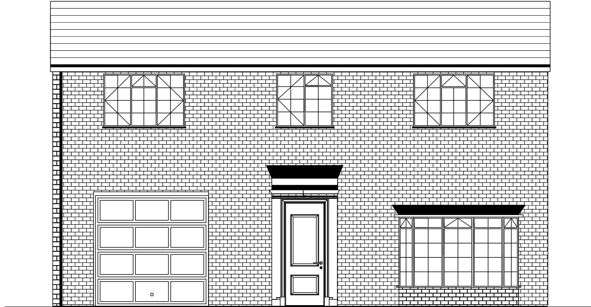
Front elevation proposed