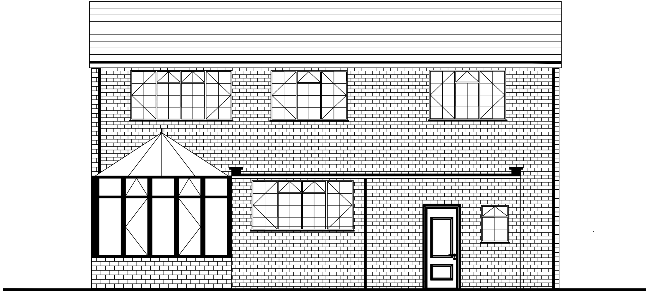
Rear elevation proposed