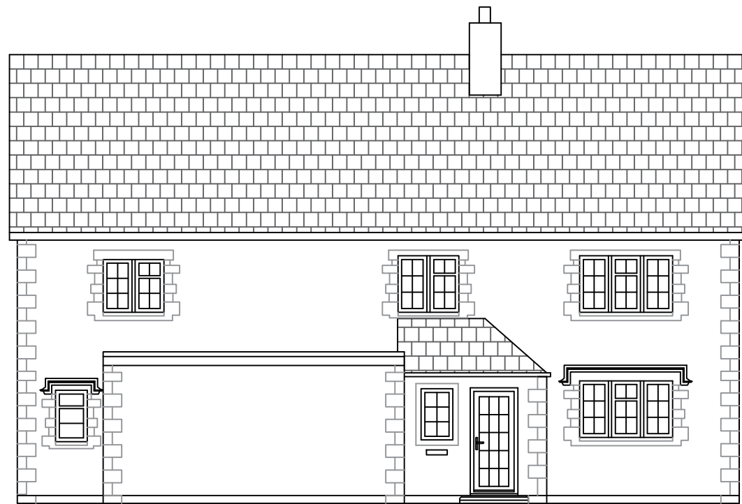
Existing north west facing elevation