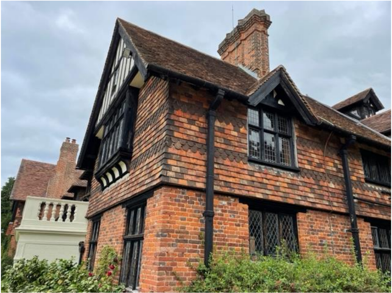
Internal Photographs - Existing