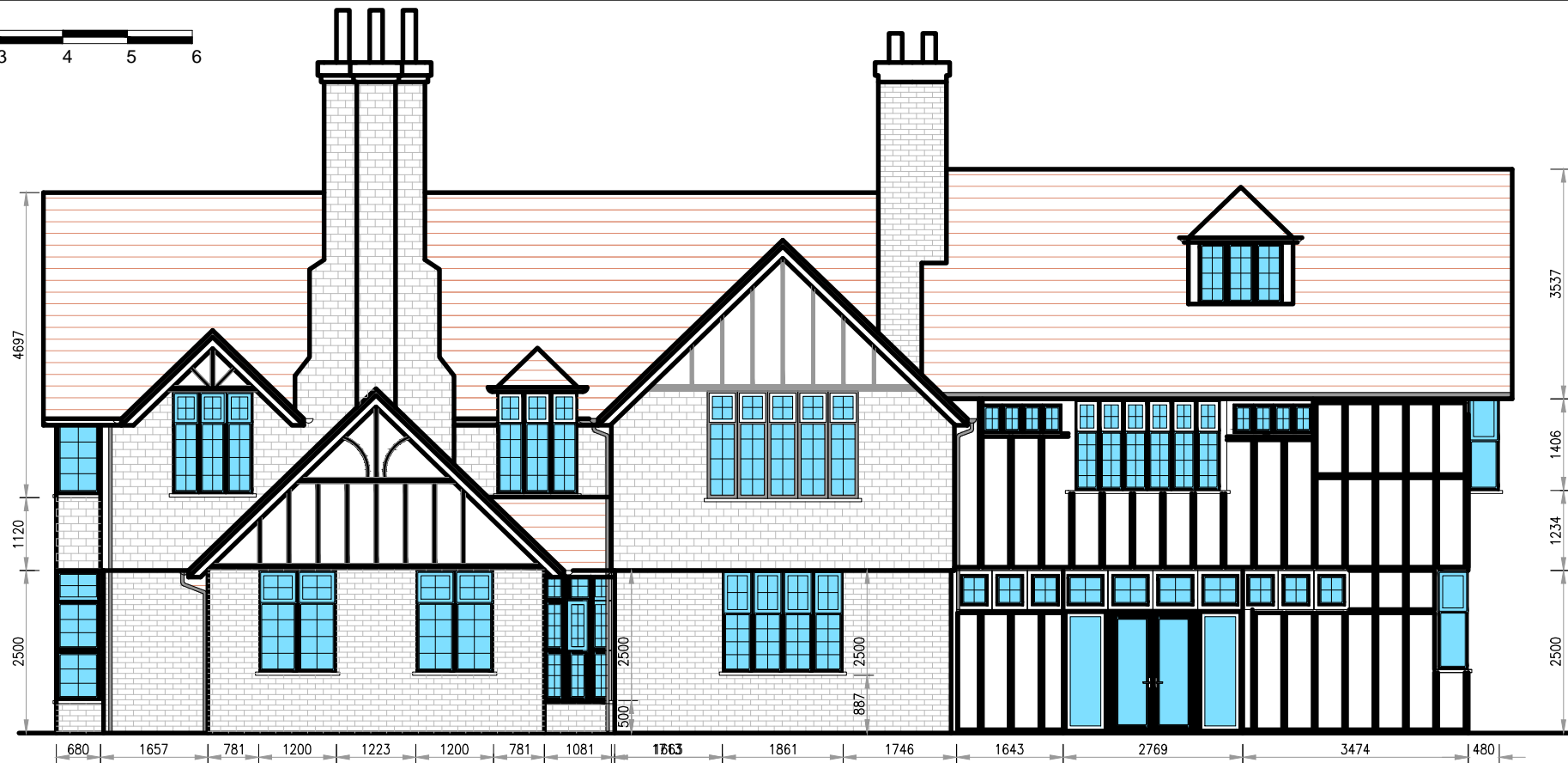
Existing Right Elevation