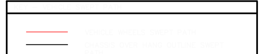
SWEPT PATH ANALYSIS – REFUSE SCALE 1:250