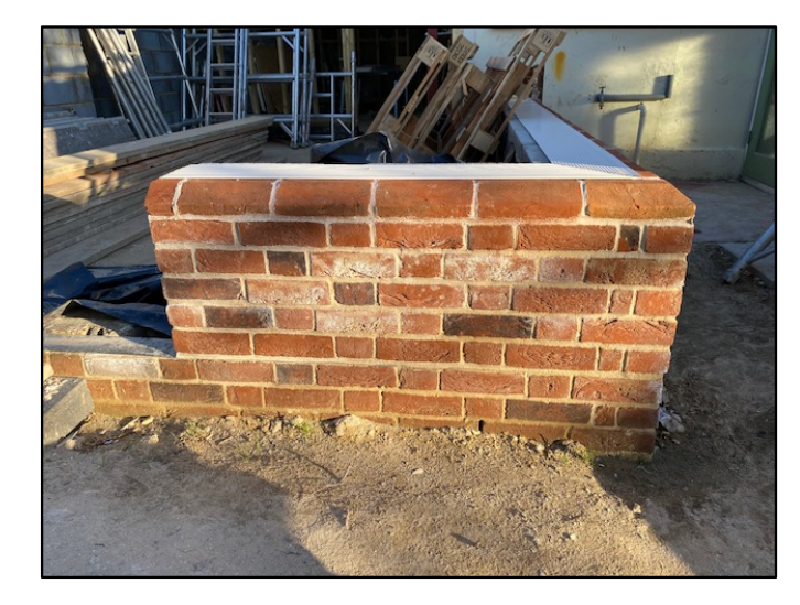
Rear Elevation Plinth Brickwork; Farmhouse Antique Brick from Traditional Brick & Stone