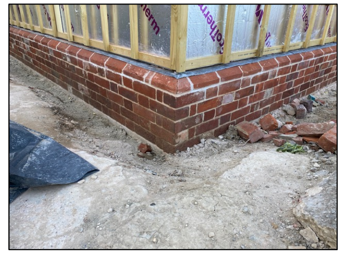
Plinth Brickwork to Front roadside elevation; Original bricks reclaimed from existing building demolition