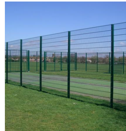
Proposed security fencing