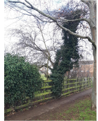
Existing timber fence and hawthorn tree

The design of the fence is to help keep pupils safe and also uphold regulations.