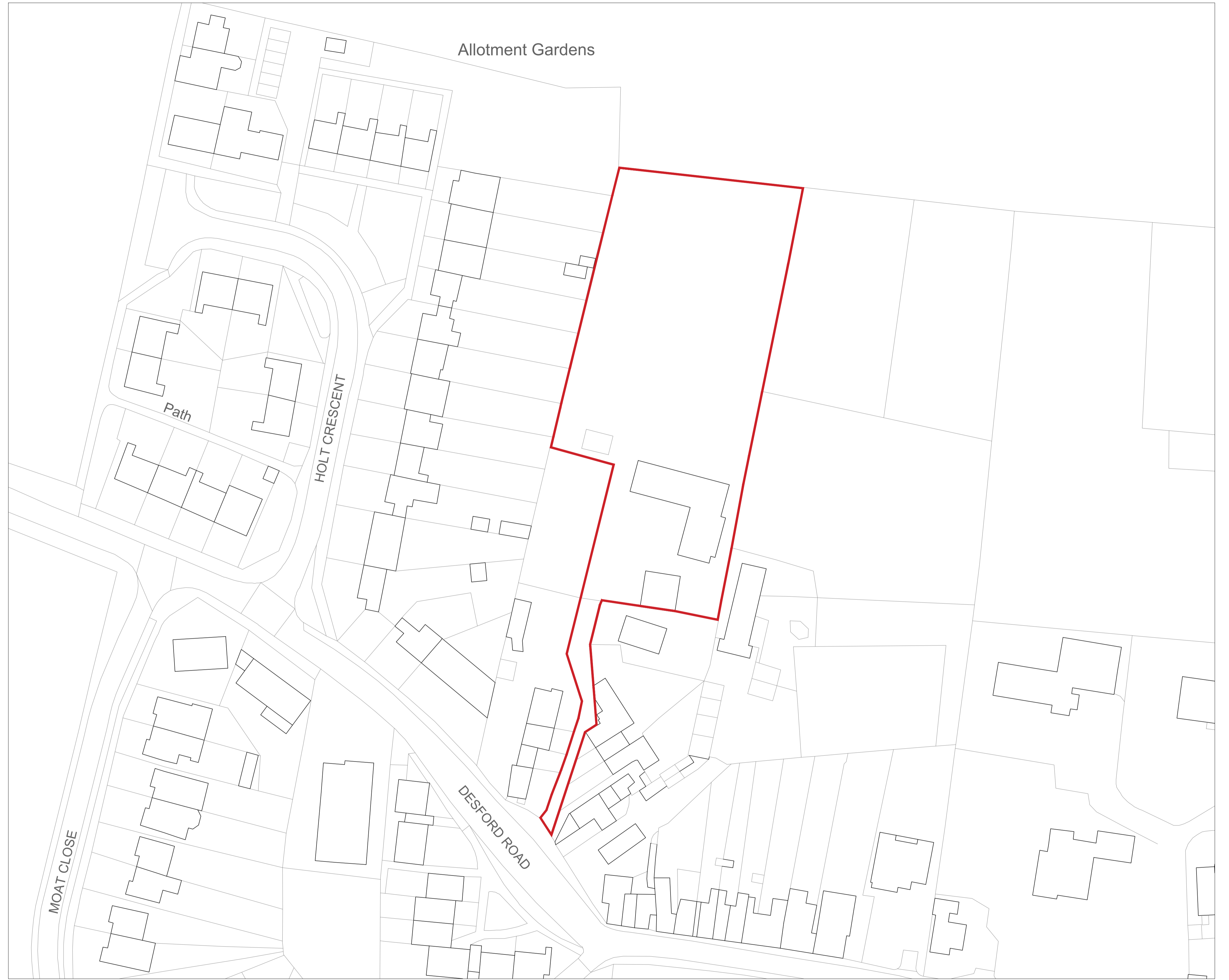
Site Plan 1:500 at A1