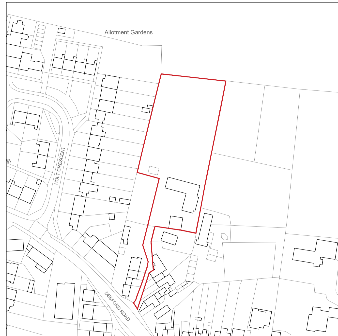
Location Plan 1:1250 at A1