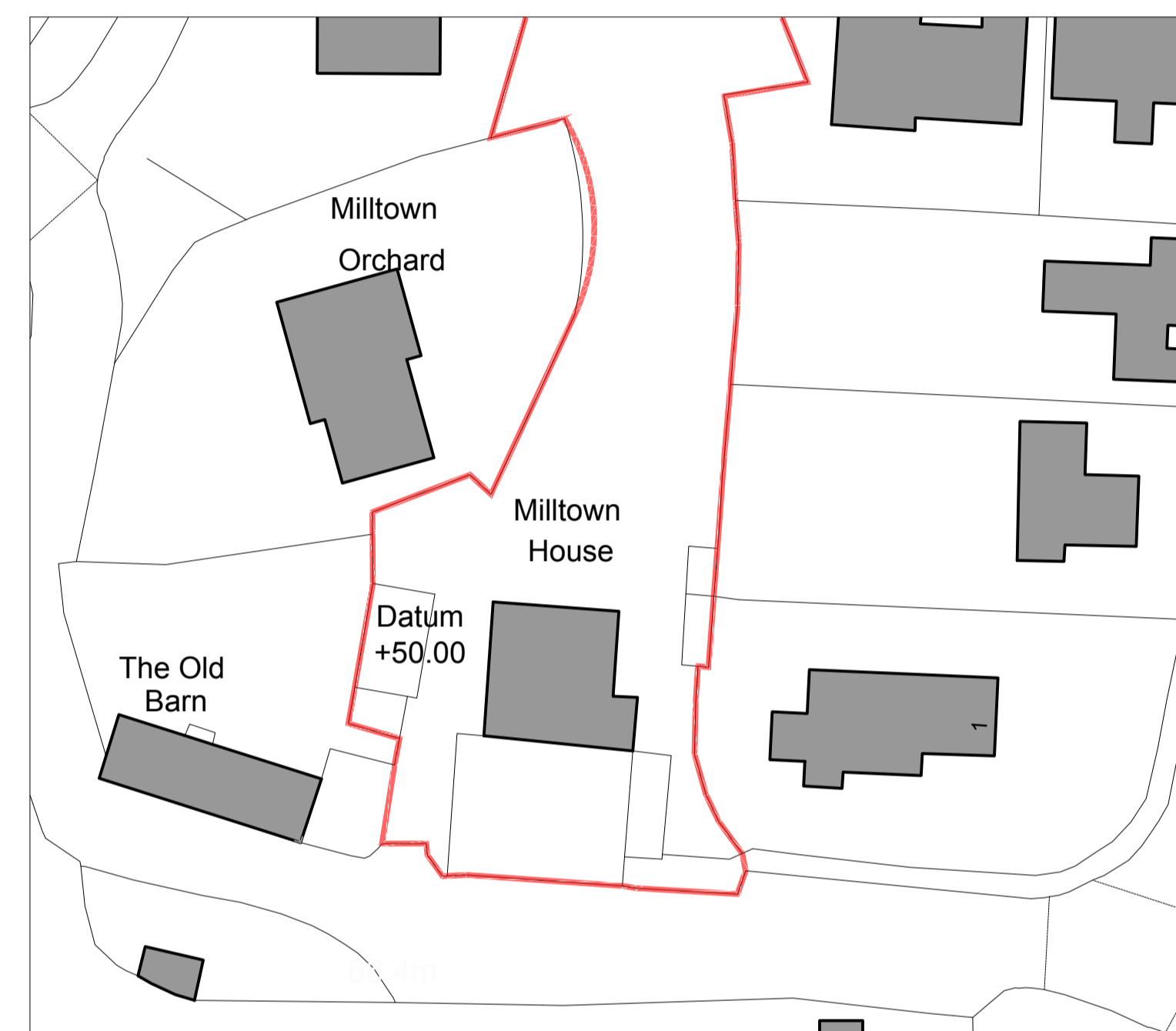
01 Existing Block Plan 1:500 0 10m 50m SCALE 1:500