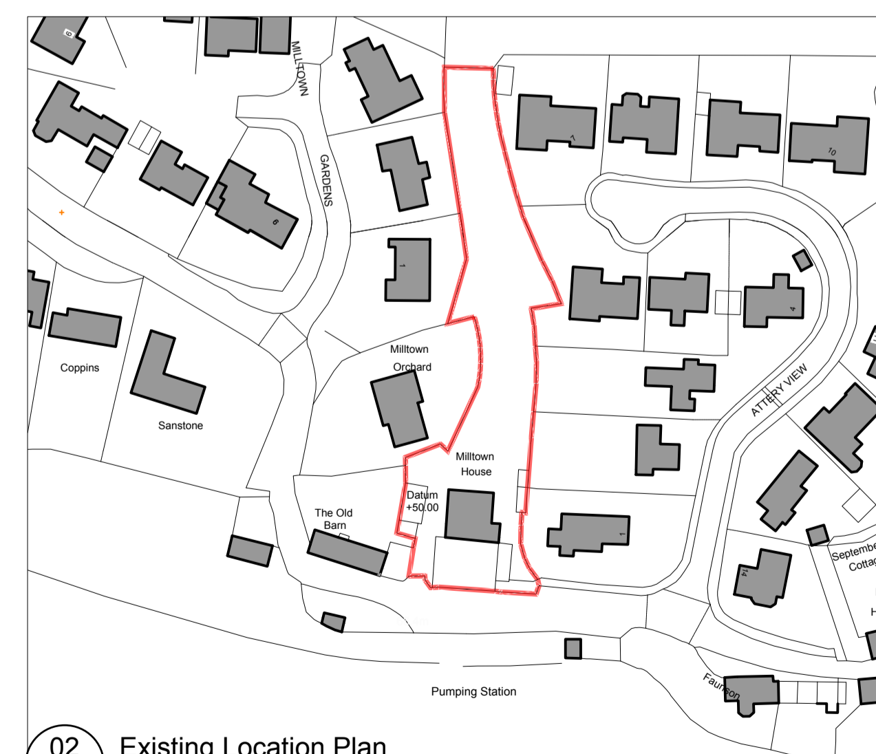
02 Existing Location Plan 1:1250 0 25m 125m SCALE 1:1250