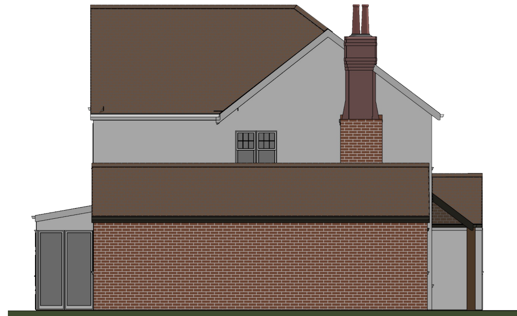
Exterior Elevation Left