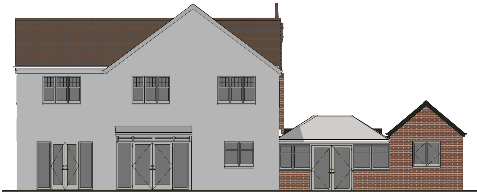
Exterior Elevation Back