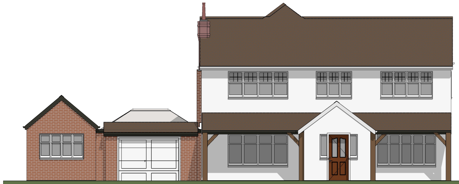
Exterior Elevation Front