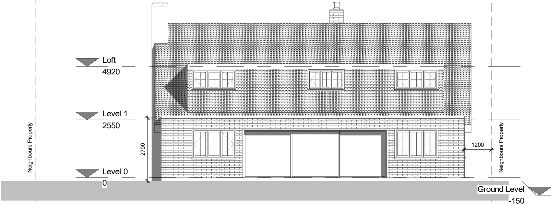
Rear elevation- Approved 1 : 100