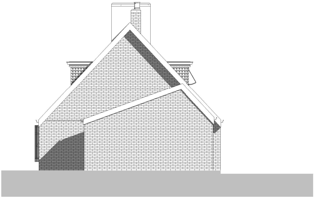
Side elevation 2 - Existing 1 : 100