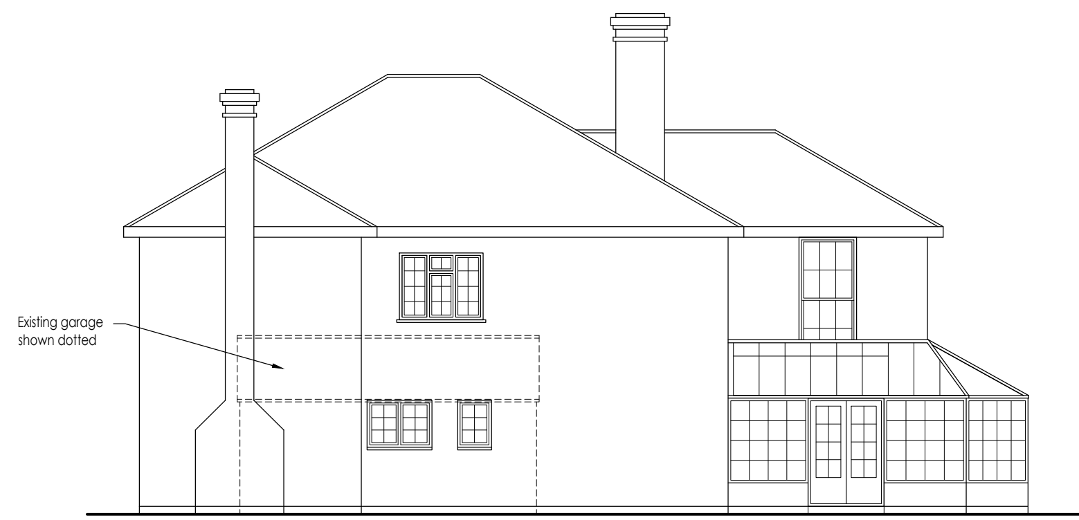
Side Elevation Scale 1:100