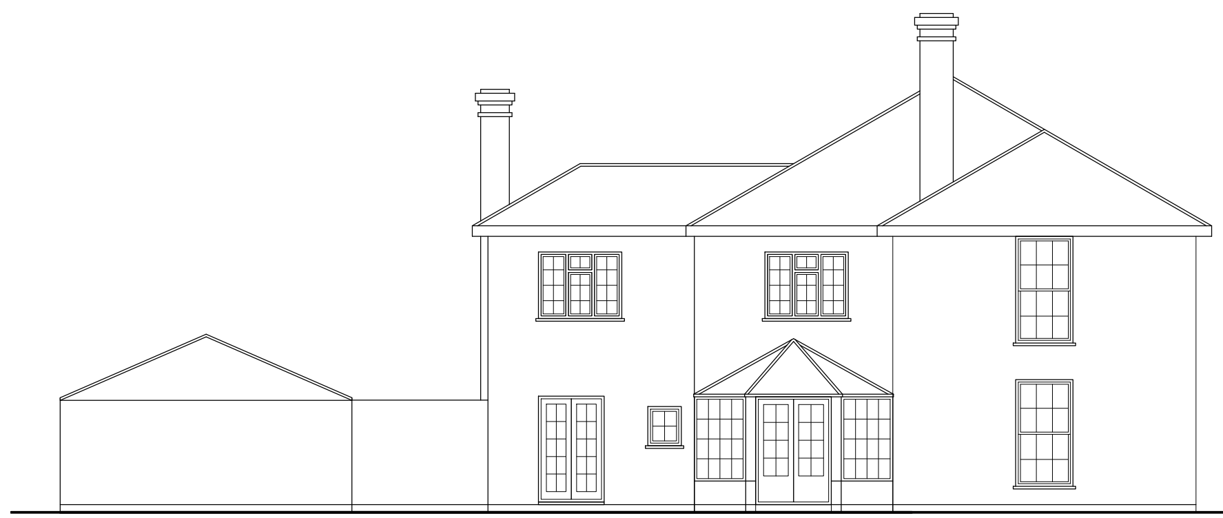
Rear Elevation Scale 1:100