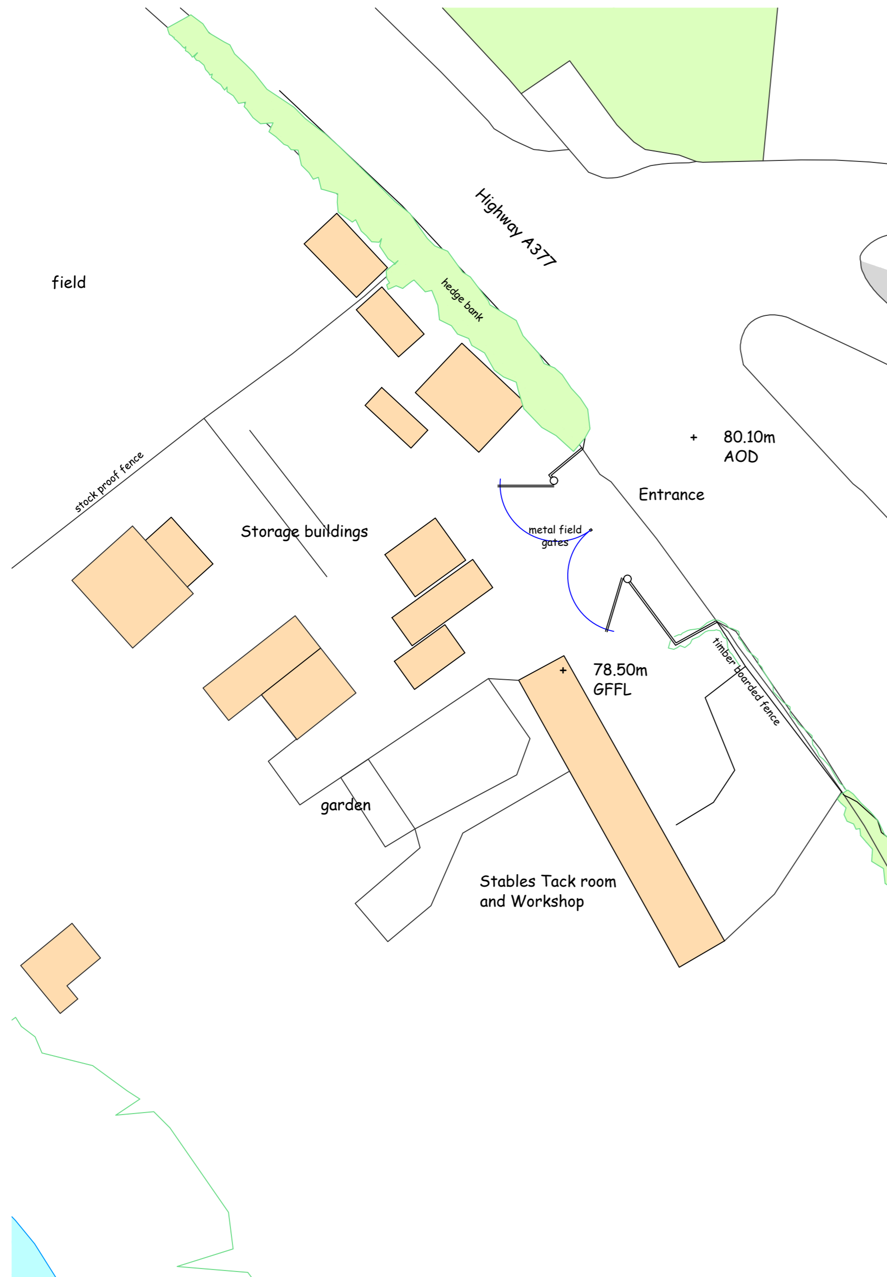
Block Plan - As Existing