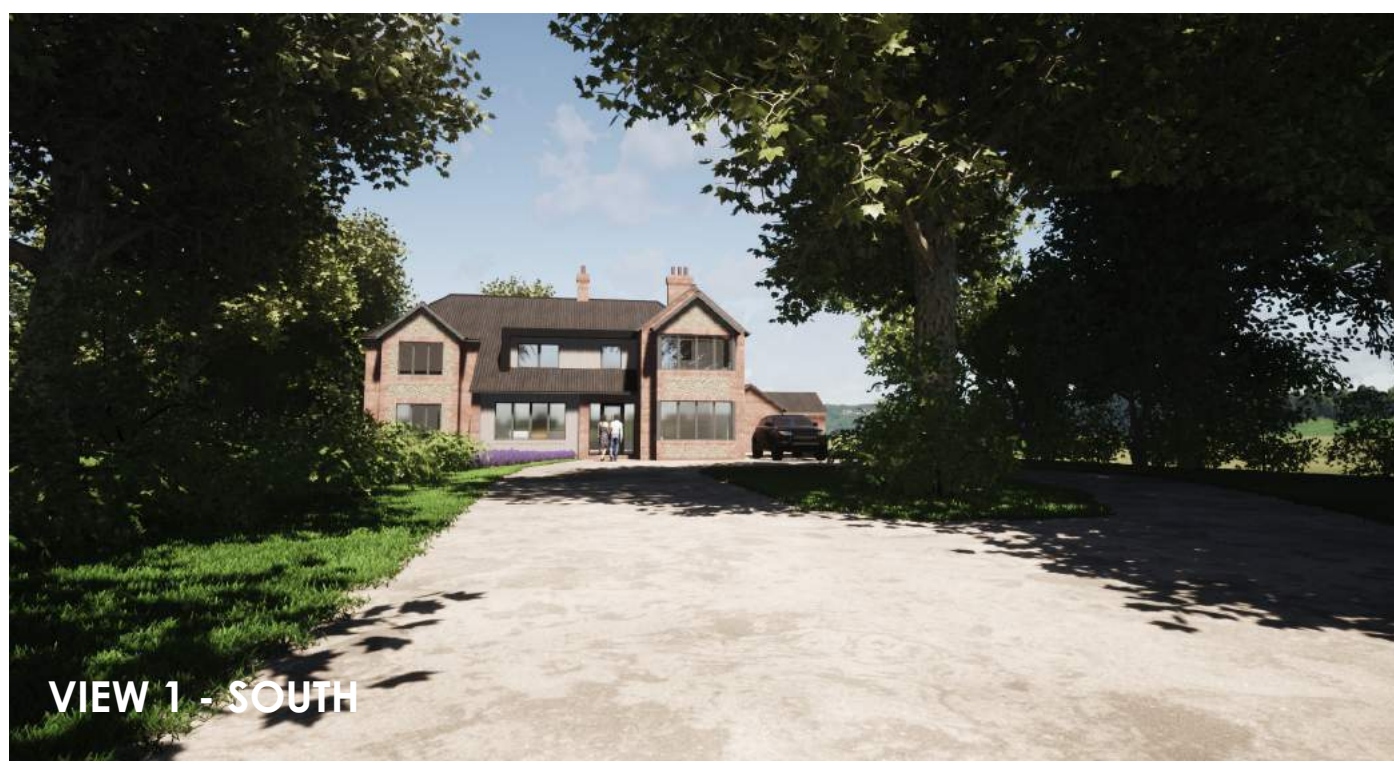
VIEW 1 - SOUTH