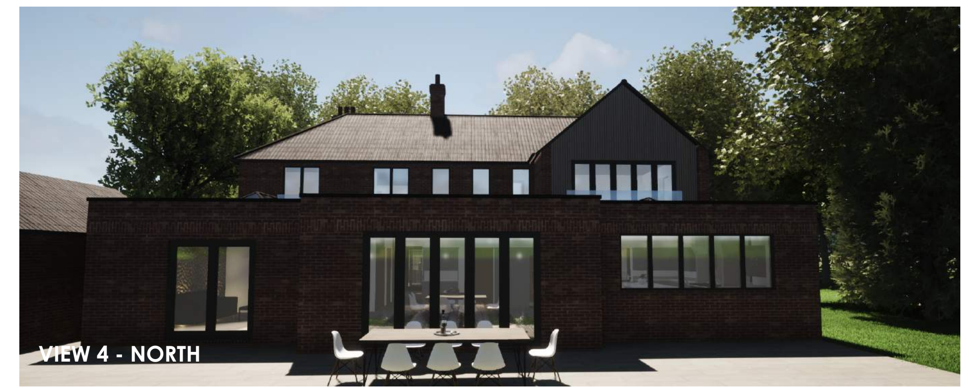
VIEW 4 - NORTH