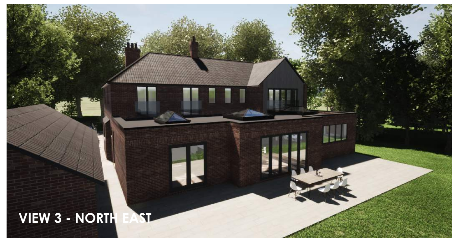
VIEW 3 - NORTH EAST