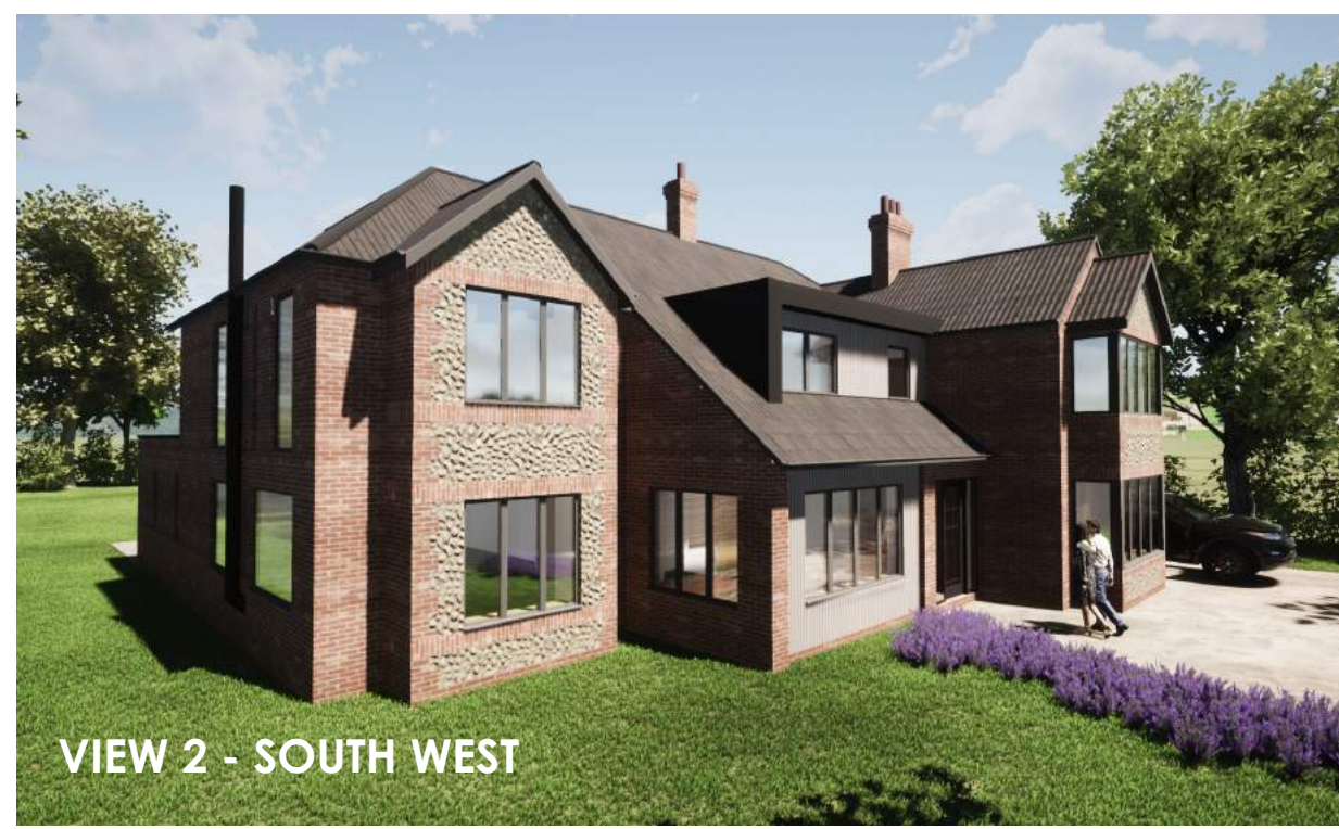
VIEW 2 - SOUTH WEST