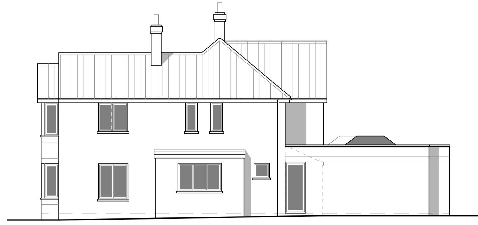
SIDE ELEVATION - EAST Scale 1:100