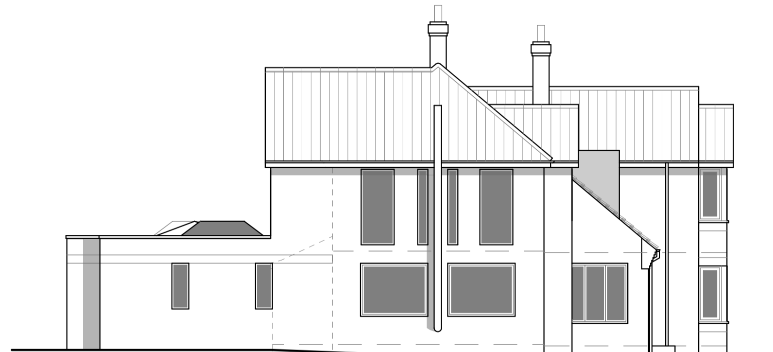
SIDE ELEVATION - WEST Scale 1:100