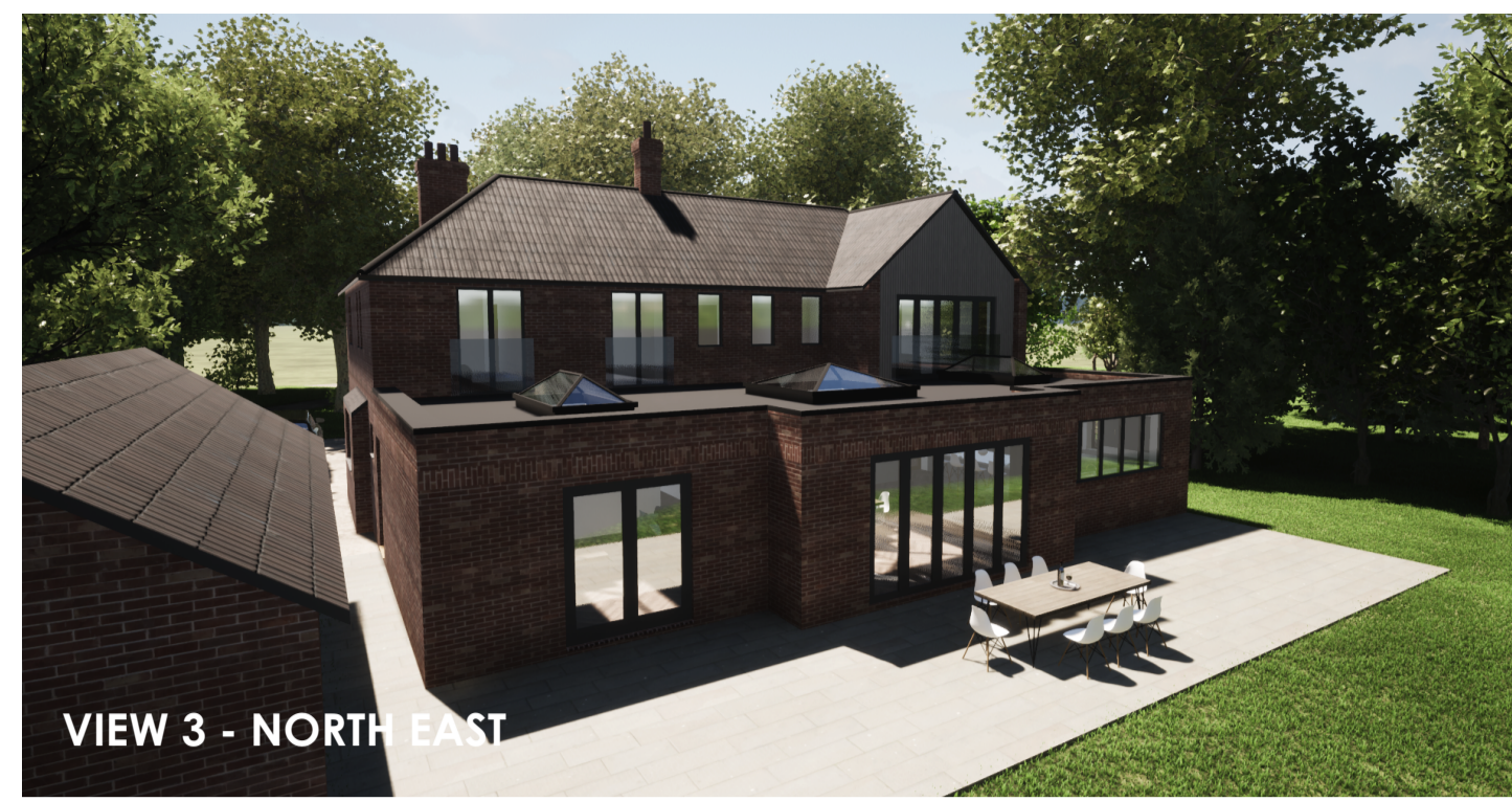
VIEW 3 - NORTH EAST