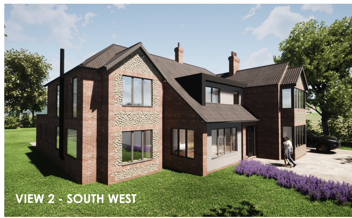
VIEW 2 - SOUTH WEST