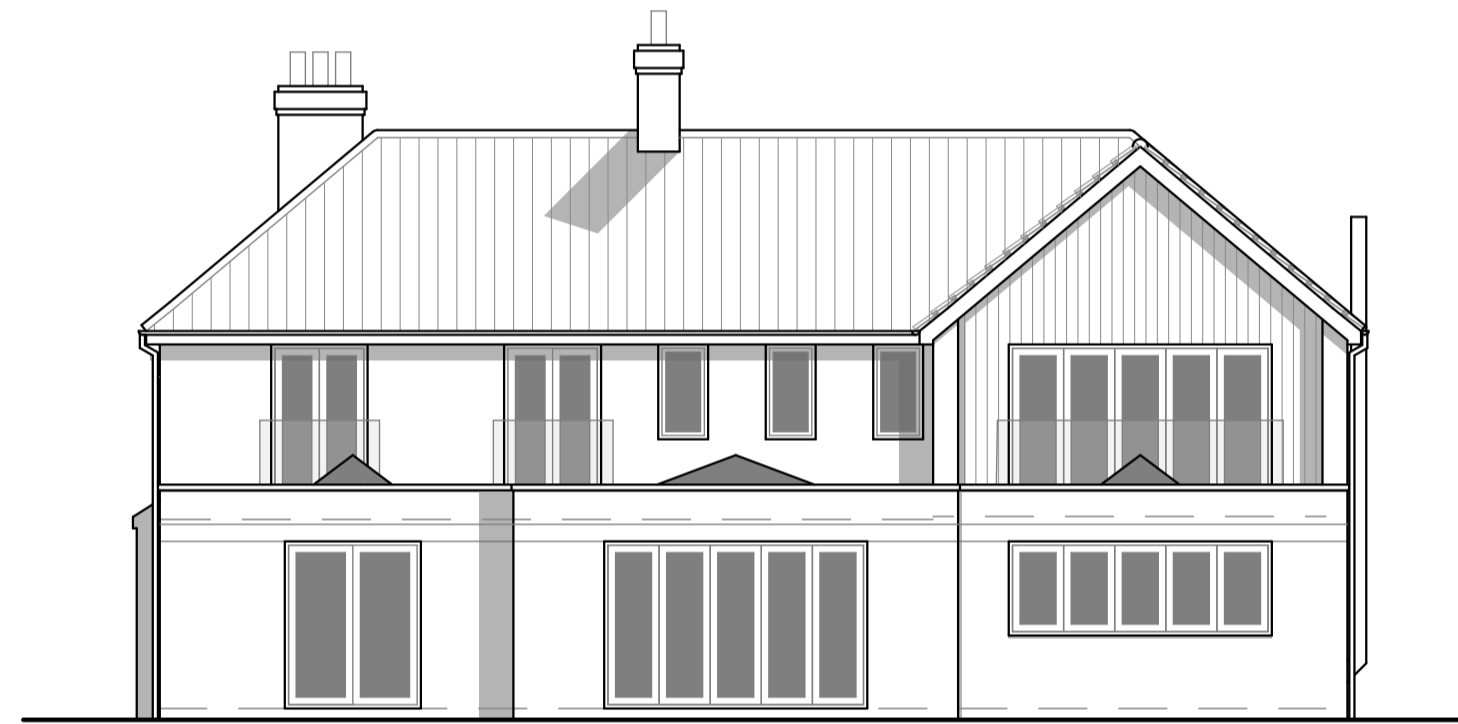
REAR ELEVATION - NORTH Scale 1:100