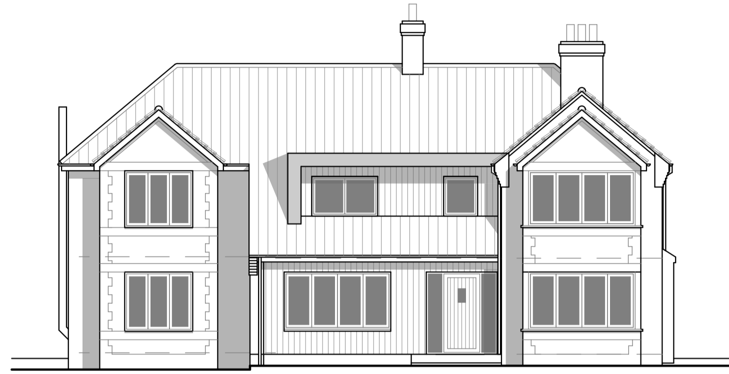
FRONT ELEVATION - SOUTH Scale 1:100