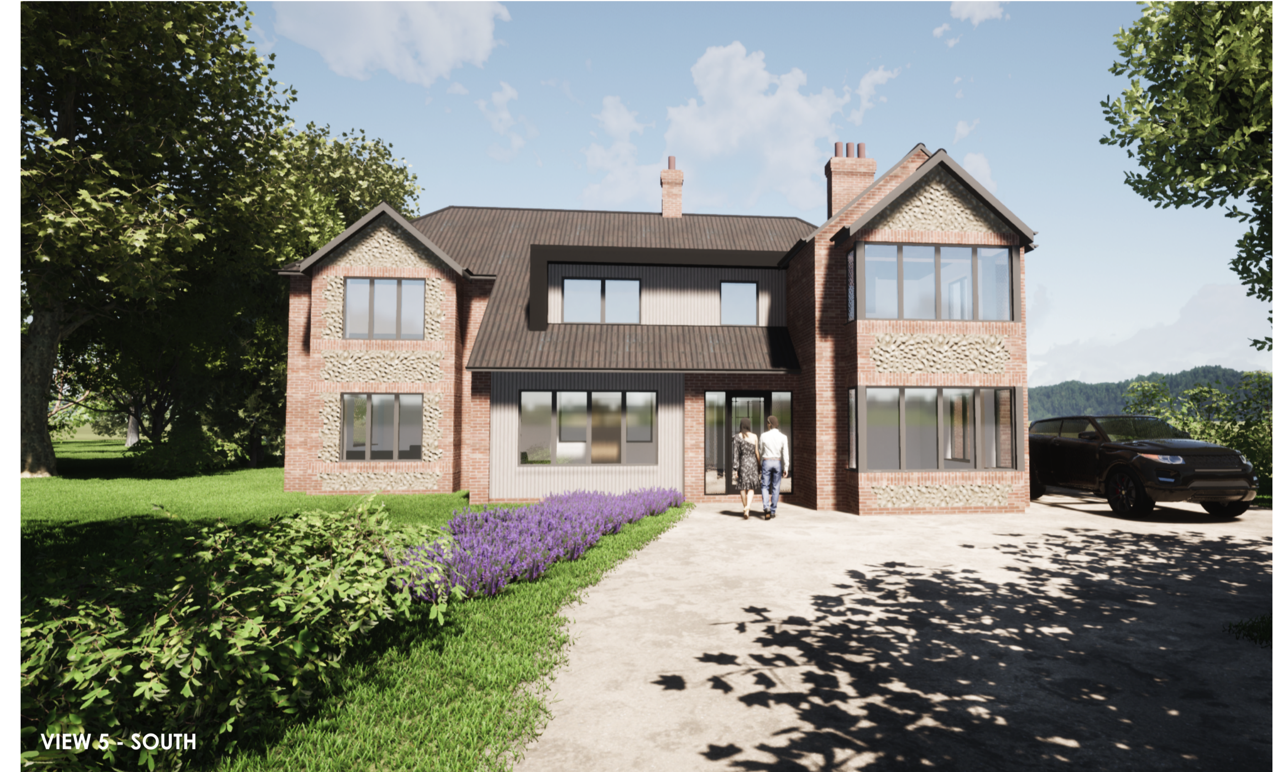
VIEW 5 - SOUTH