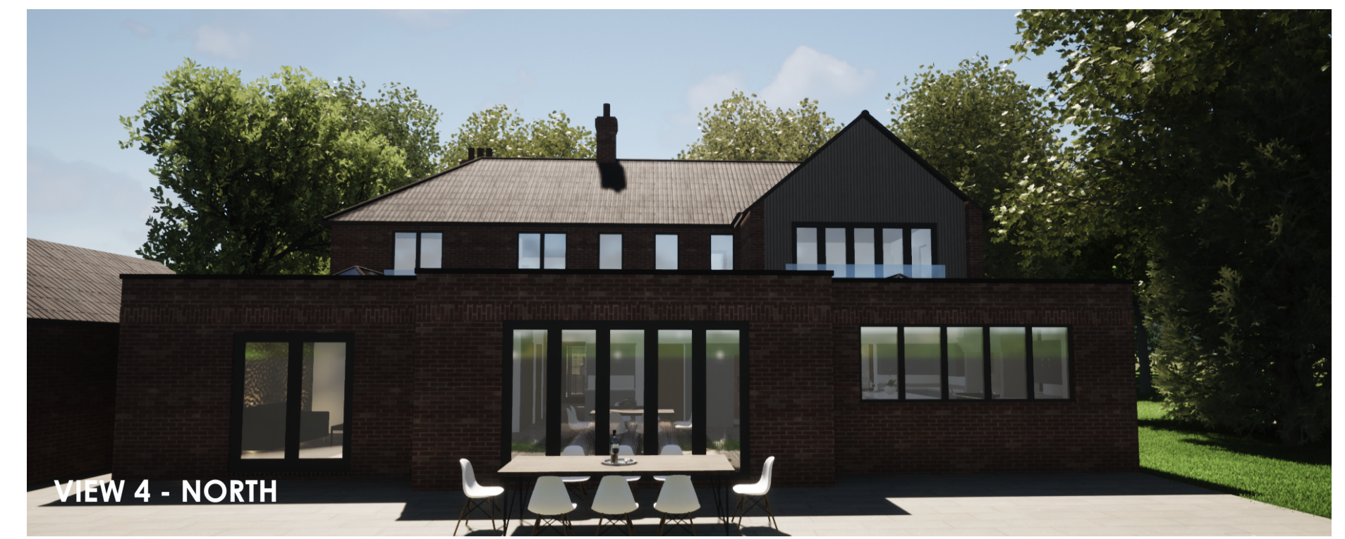
VIEW 4 - NORTH