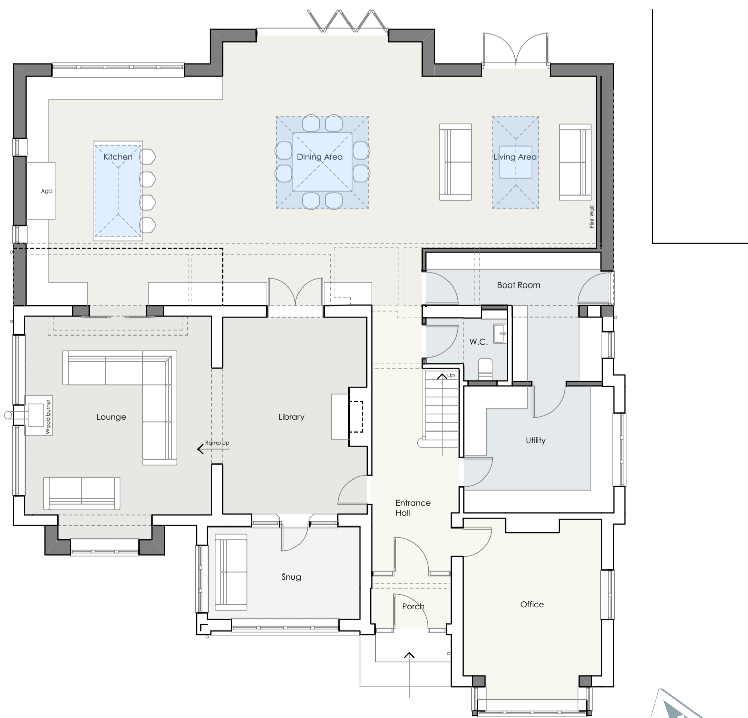
GROUND FLOOR PLAN Scale 1:100