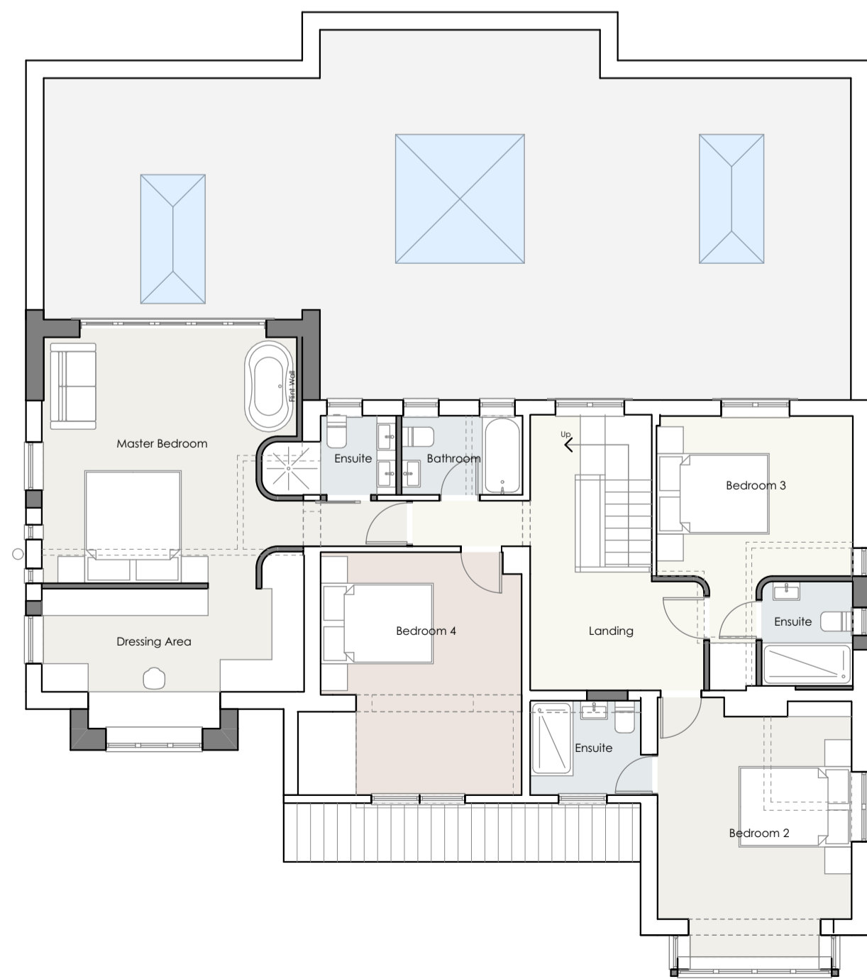
FIRST FLOOR PLAN Scale 1:100