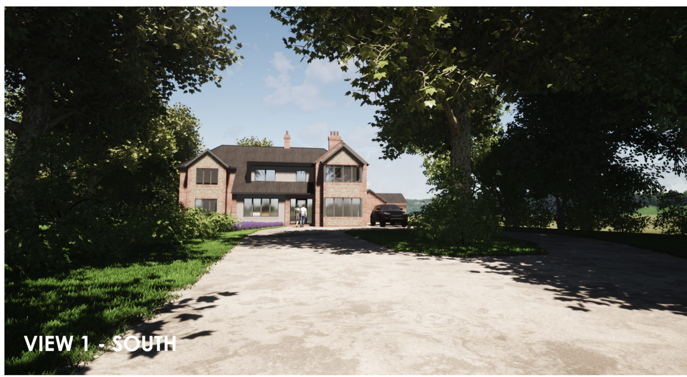
VIEW 1 - SOUTH