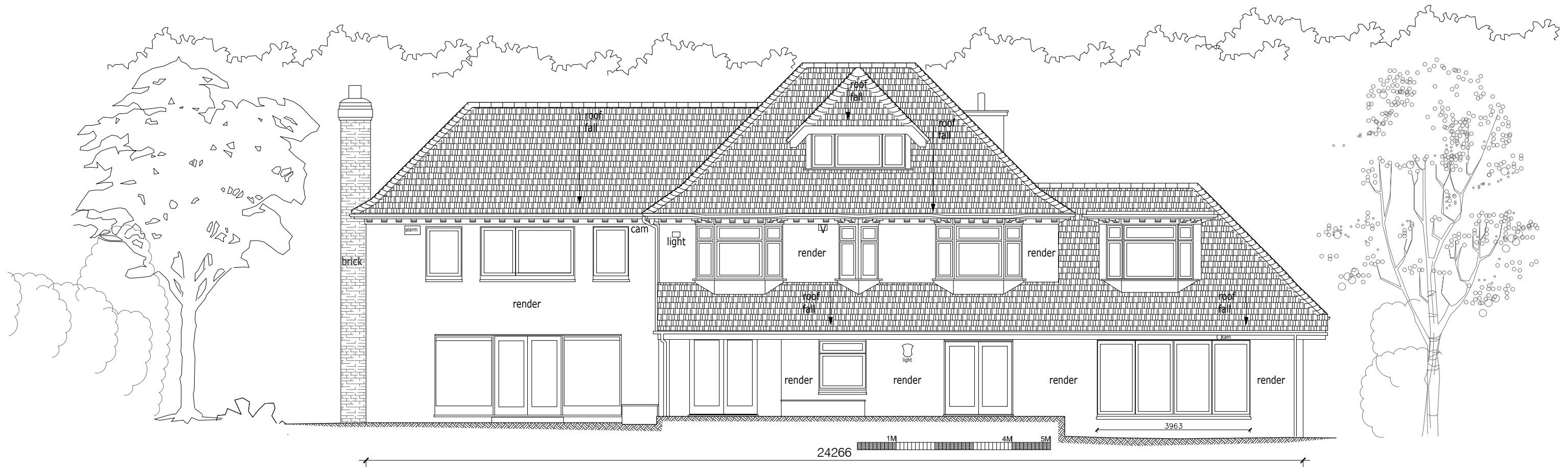
EXISTING MAIN HOUSE SOUTH ELEVATION SCALE 1:100@A3