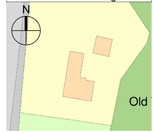
Location plan (not to scale)

Contractors and consultants are not to scale dimensions from this drawing