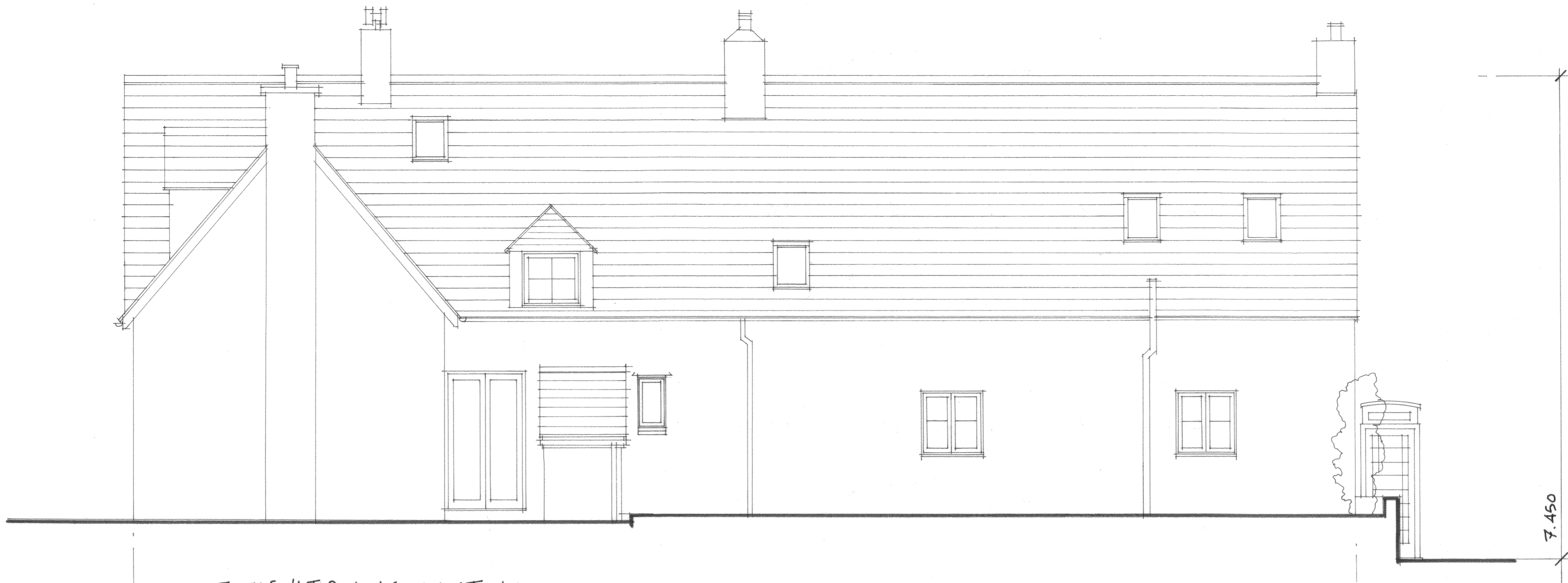
EAST ELEVATION AS EXISTING.